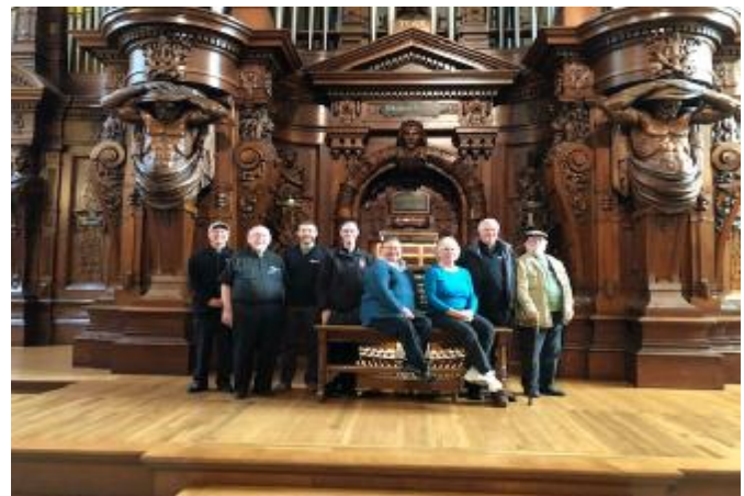
Some of the Mary Mother of God Mission Society executive board on stage at the Methuen Memorial Music Hall.

Stopping in several east coast states and visiting such important sites to our American history fulfilled some of