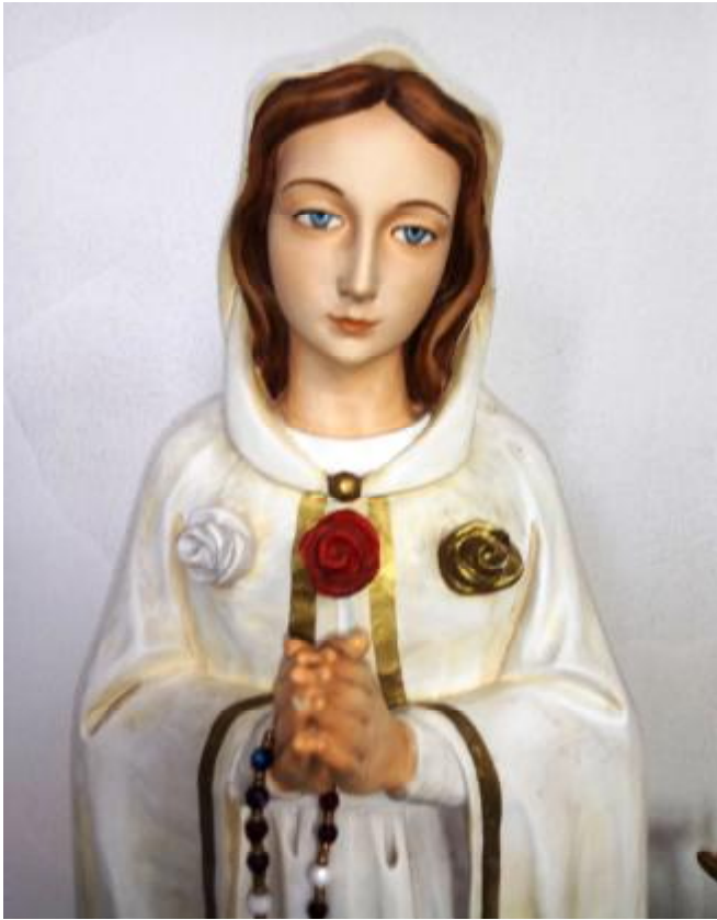
Rosa Mystica—The parish's first statue