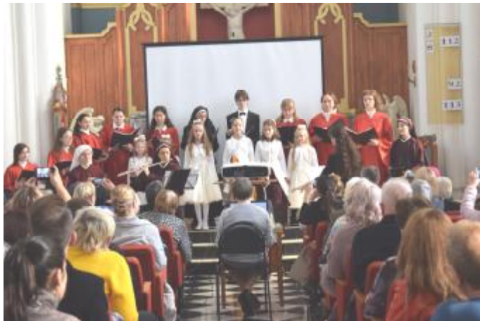
Children from Romanovka express their appreciation for the sisters' work with children in Romanovka

In the first several decades of their existence the sisters expanded to many hospitals and started homes and schools for abandoned children throughout Spain. In 1890, with the vision and direction of the dynamic superior general, Mother Pabla Bescos, the congregation opened its first missionary community outside of Spain - at an isolated leper colony on the Venezuelan island of Providence. Communities on other continents followed: Asia 1951 (India); Africa 1970 (Ghana); Australia (1985); and in Papua New Guinea (1992), Philippines (1996) and the latest one in Kosovo (1999). Now there are more than 2000 sisters in 37 countries on 5 continents and in Oceania. The local community in Vladivostok belongs to the vice-province of St. Francis Xavier with headquarters and several communities in the Philippines and with other communities in China, Papua New Guinea, Australia and Russia - the one community in Vladivostok.