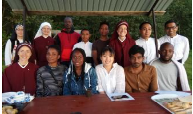
Foreign students who attended the Fall meeting

• How can we encourage the Catholic foreign students who are studying in Vladivostok to become “churched”? We think it can be solved if we can have a facility near the university where we can have mass, meetings, and social events for students in the variety of languages—English, Spanish, and Vietnamese, as well as Russian. Meanwhile our sisters who live near the university are encouraging students to participate in parish events. Here is a photo of a recent meeting of the sisters with some foreign students of the Far Eastern Federal University.