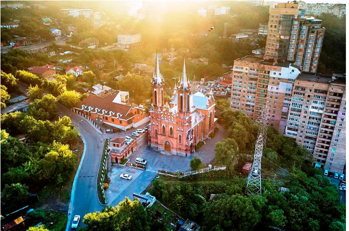
Our Church of the Most Holy Mother of God in Vladivostok as seen from a drone

Issue Number One Hundred Forty Five January, 2019