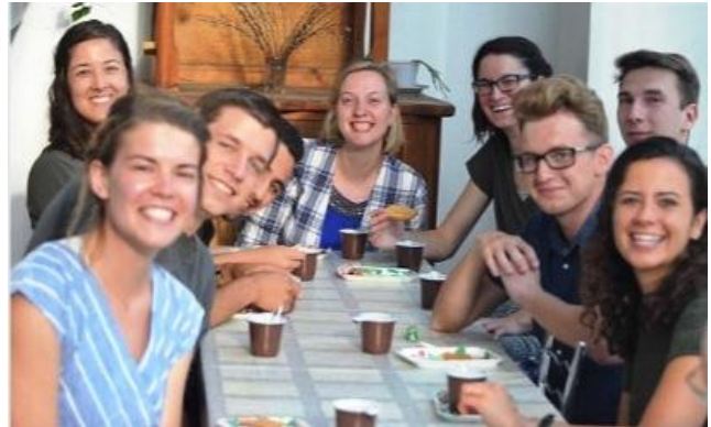
The FOCUS team always helps!