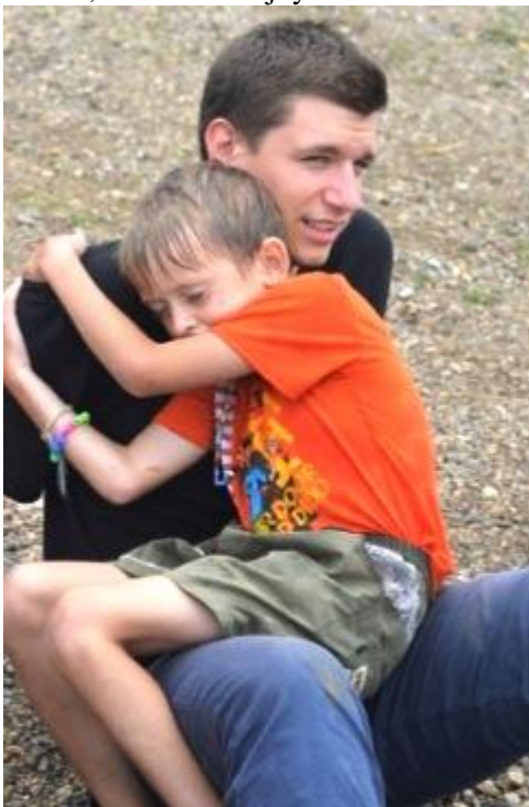
Love can be intense if you've had no dad.

The willingness of people to share their stories as well as the history of Russia – especially that of the Far East – shatters my heart. For all that they have endured, many people feel hopeless. Their hope has been stripped away due to the suppression, repression, and oppression under communism. Many individuals who had a strong faith were imprisoned and martyred. Yet to see thirty years later, the youth of Russia, they are hungry for spiritual food. They desire to grow in their faith – through prayer, through the sacraments, through vulnerability. Amid hopelessness, there can be joy!