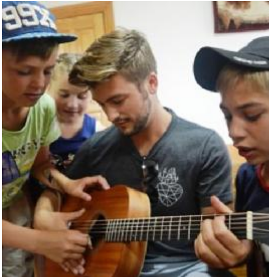
It's humbling when the kids show you how to do it.