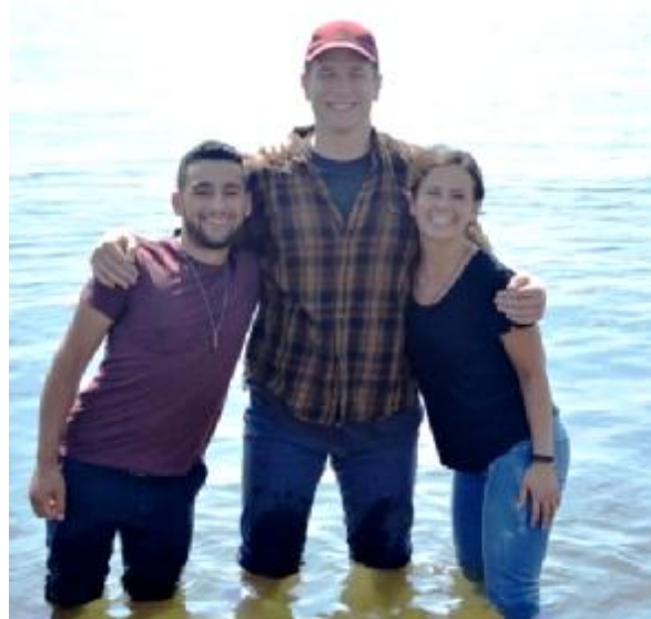
I don't think this is the kind of immersion she had in mind.

prayer. I have begun to understand and encounter Him more deeply through the mass as it is the source and summit of our life; it is our foundational prayer.