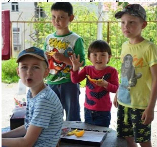
What? Afraid of them? Ever hear of the Little Rascals?

When it comes to discernment, there needs to be action. Little did I know or expect how God would use my “Yes” to His call. He answered through financial provision. He directed my steps through prayer. He exceeded all my expectation because His plan is more extraordinary than anything I could have planned for myself. I feel speechless when trying to describe my experience in Russia. During the final week, while in Khabarovsk, I began to pray for words. These words barely touch the tip of the iceberg, although, it’s a start.