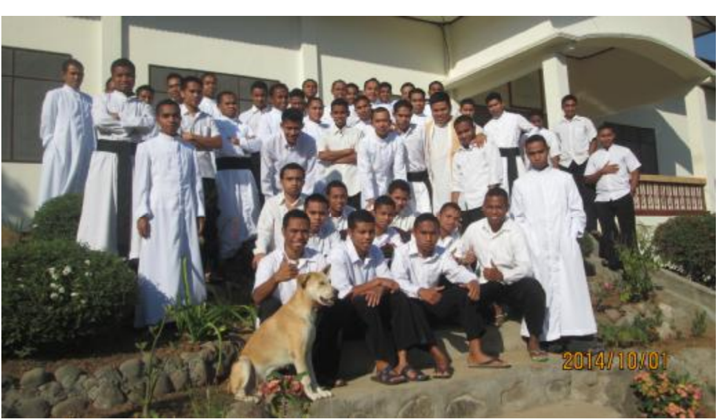
Seminarians from the Vocationists' seminary in Maumere, Indonesia, who came to see me off. Four of our seminarians live and study with them.

More good news is that the Franciscan Mission Warehouse in Kansas City has shipped to us 41 used electric hospital beds! We had to buy new mattresses to ship with them, and we have to pay for transportation and customs expenses. It is a wonderful opportunity, so we can't pass it up. We are looking for funding for our part of the expenses. Most of the beds will go to the Hospice in Vladivostok, and the rest to the general city hospital in Lesozavodsk where our Women's Support Center has been located many years already. They also don't have proper hospital beds either! Both places have only flat beds currently, so you can imagine how difficult it is for sick elderly folks to eat the usual Russian soup without getting it in their lungs. That is a cause of dangerous lung National Office: 1736 Milestone Cir • Modesto CA 95357 • 209-408-0728