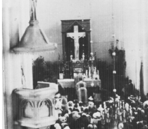
The Crucifix in 1922.

Today was an historic day for us! As part of the church restoration we placed the heavy marble crucifix back in the same spot it had occupied in 1922 when the church was consecrated! So I can't help but show you the pictures!