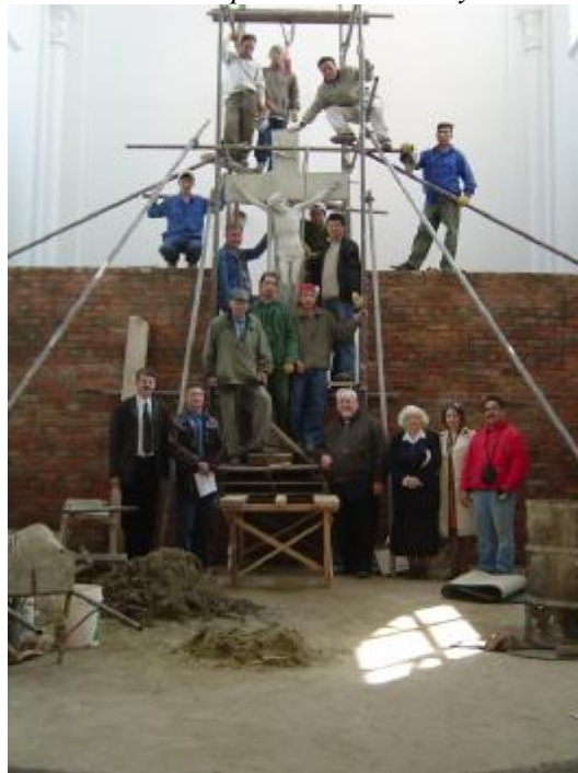
The workers and parishioners today.