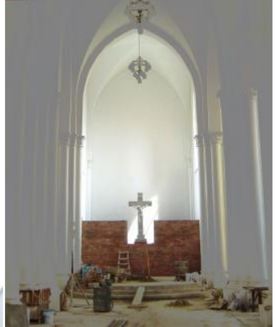
The Crucifix in place today, May 14, 2007.