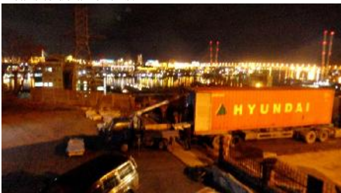
Blistering cold as a front rolled by in the night was the setting.