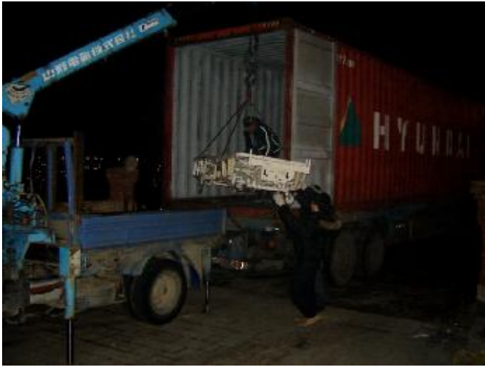
Even with a crane, it was a tough job.