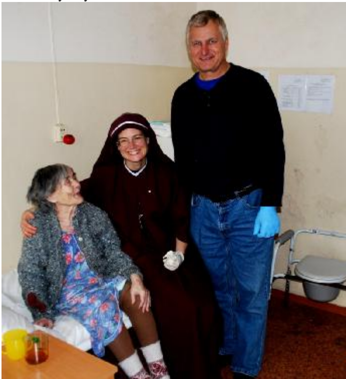
Such a comfort to have caring people around.

We learned a lot on our trip to Russia but the biggest thing we took away was that knowledge about the word of God is desperately needed. It is not the Russian peoples' fault that they don't know the word of God. The communists did such a complete job of killing or imprisoning anyone who had anything to do with religion. In many ways without God a society becomes dysfunctional. The selfless work the religious and other members of the Mary Mother of God mission is critical to the people of their area. Our new family has a special place in our hearts and we will continue to pray for all of them and support them in any way we can.