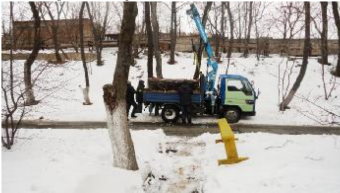
Unloading at the Hospice

We were already able to send the beds to the Hospice here in Vladivostok, and soon to the City Hospital in Lesozavodsk. Here is a photo for you from the Hospice. The patients can now push the button and sit up or elevate their feet. Of course we and the patients will be forever grateful to those who made it possible.