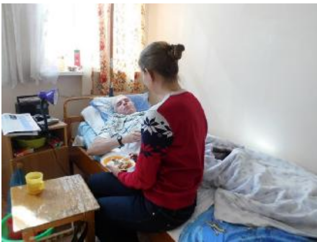
A volunteer at the hospice by a new reclining bed.

We were already able to send the beds to the Hospice here in Vladivostok, and soon to the City Hospital in Lesozavodsk. Here is a photo for you from the Hospice. The patients can now push the button and sit up or elevate their feet. Of course we and the patients will be forever grateful to those who made it possible.