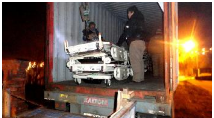
We had a crane to remove the heavy beds from the semi.

● February 20 was a great but difficult day, rather, night! The container full of beds was delivered to us to unload at 8:00 on Friday night from Russian Customs. It was great that the novices were here, and they worked until 12:30 unloading and storing them. We don't have a large warehouse, so we had to put them temporarily in the church. Thank you to the Franciscan Mission Warehouse in Missouri for sending the beds to us. They will be a great help to the dying folks at the Hospice, and for patients at the Lesozavodsk City Hospital. We still have the job of sorting them, attaching spare parts, checking on their electrical requirements, and delivering them to their destinations. Thanks, Donors, who helped provide the means to do all of this!