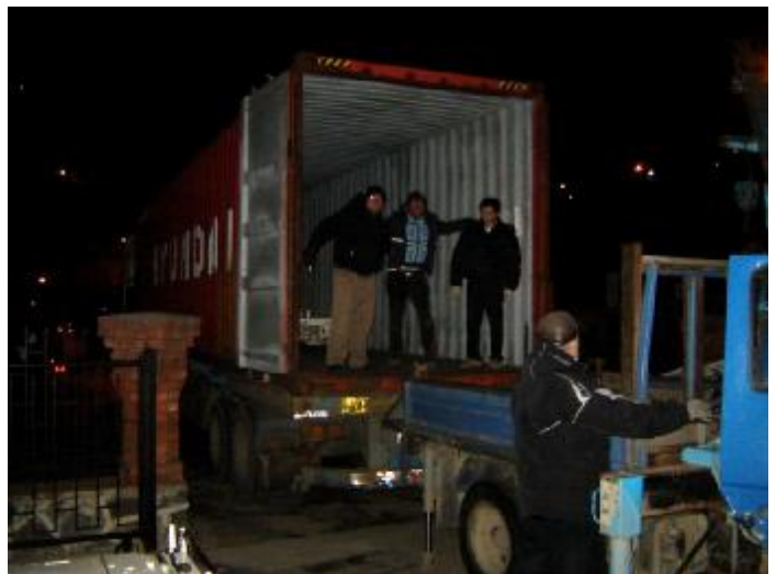
The novices really worked as a team to get the job done.