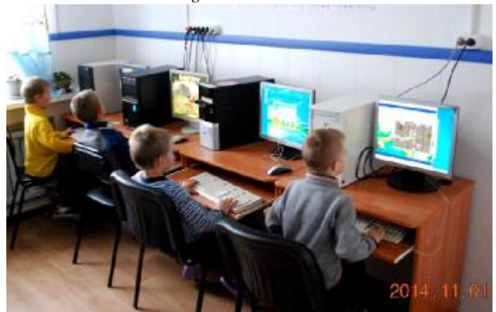
Kids in Romanovka doing what kids didn't used to do.

We have always known that our church is worldwide and it was awesome to find our church family on the other side of the world. We attended daily mass. Meals were a very enjoyable time to get to know each other while cooking and eating. While we were there we were made to feel like everyone was part of a family. We heard so many stories about the history of the church and how they got it back as well as all the work done to get where they are now. What a miraculous story!