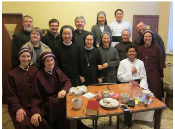
Sisters from Russia, Korea, and America, with priests and brothers from America, Italy, Kazakhstan, Poland, the Philippines, Indonesia—all serve in our state of Primorye.