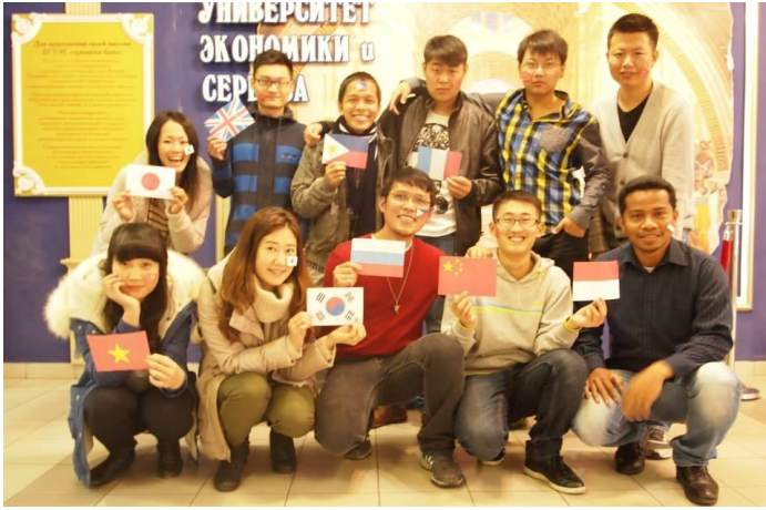
With his fellow students at the university from many nations.

I decided to take part in this mission because I saw the necessity that the Catholic people and even some others in Russia needed some missionary to work with them. They need somebody to show them how to become a believer in Jesus Christ? how to become a Catholic? This fact reminds me with the writings of one of the great Theologians in our church, Saint Augustine. He wrote “But how shall they call upon One in whom they have not believed? Or how shall they believe without one to preach?” This phrase of Saint Augustine gave me strength to answer God’s invitation. As a Augustinian brother, I felt that I also have that kind of responsibility to introduce Jesus to the whole world especially in places that not know Him yet.