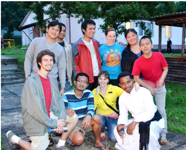
At the Far Eastern Catholic Youth conference

For me personally these experiences really had a great influence for my vocation. They gave me an idea about how to become a priest. What kind of a priest am I going to be? Thank you Russia for these experiences. Thank you very much. Praise to Russia!