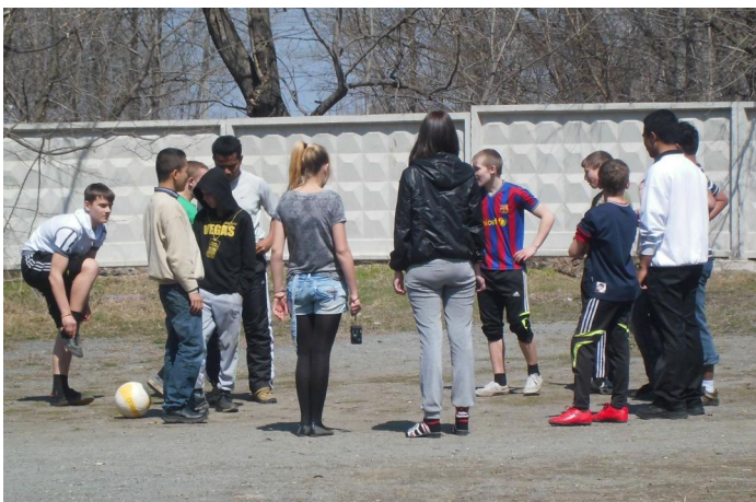
Playing soccer with the kids at Parus Nadezhdi

Culture shock was the first thing I experienced like many other people experience when they go to a new places or countries for the first time. There were some things that I needed to adjust to, like weather, food, and also how to communicate with people. But I never bother myself much with this kind of things. I believe God will help. And in fact I really enjoyed my stay there. This situation of course changed my former understanding, my earlier assumptions about Russia. There were some