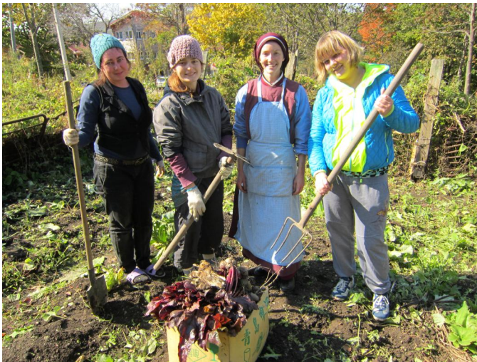
Nothing like a little Fall cleanup to peak the appetite.

● Every Fall on the Sunday before school starts there is the blessing of pupils and teachers in Vladivostok, and it wouldn't be complete without everyone getting an apple!