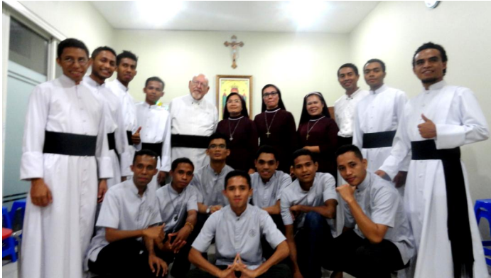
Six candidates in cassocks and seven postulants in grey shirts gathered with us in “Our Lady of Vladivostok” chapel in Surabaya on December 7. Three Sisters in Jesus the Lord of Indonesia also were with us. The seminarians are great singers with booming voices and really enjoy a rousing musical performance. They have founded a children’s choir here in the city of Surabaya, too, as well as a soccer team.

On December 7 six Indonesian seminarians received their candidate's cassock from my hands, which means that they are planning to join our C.J.D. community and enter novitiate as soon as they finish their college degrees.