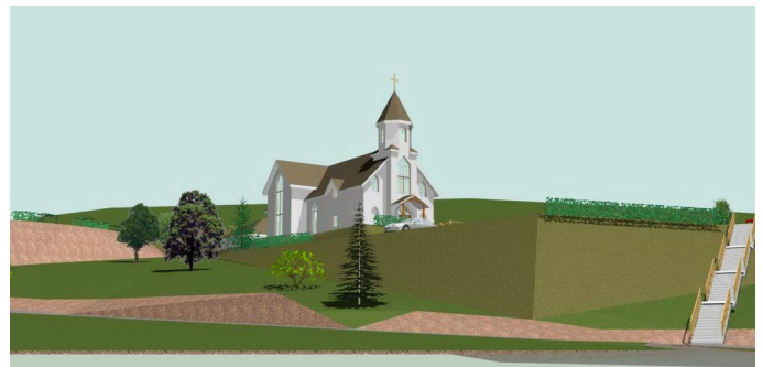
Planned church of Our Lady of the Pacific as seen from the busstop nearby.

Our Lady of the Pacific in Nakhodka. Immediately within three days, he collected all required documents and went to the registry office to register the land. But only in December did he manage to register the land! So now finally the process of acquiring the land is finished. He says, "Now I signed the contract with the architectural firm 'Nakhodka Project' and they promised to start working on the structural plan for the church as early as possible. According to the contract the structural plan and permission to start the construction work will be ready within 120 days. Meantime I have to conclude the contracts for electricity, water, and city heating system. The architects' fees are whopping $16,000.00. A long way to go but things are moving in the right direction so we can start construction of our church. So I ask your prayers."