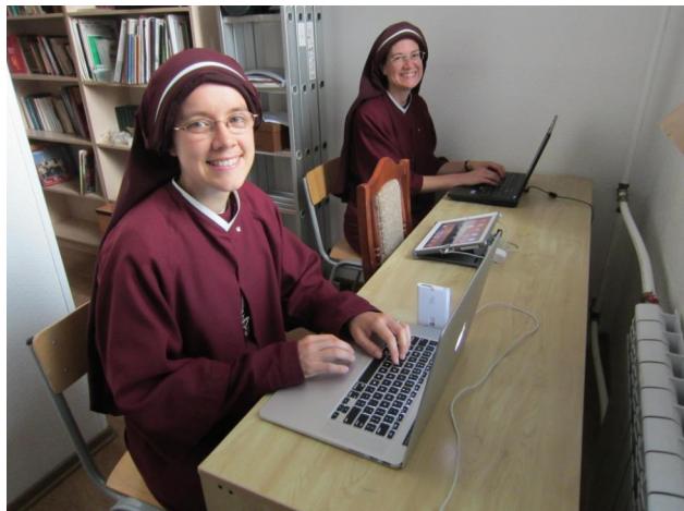
Sisters home at last on Russian Island