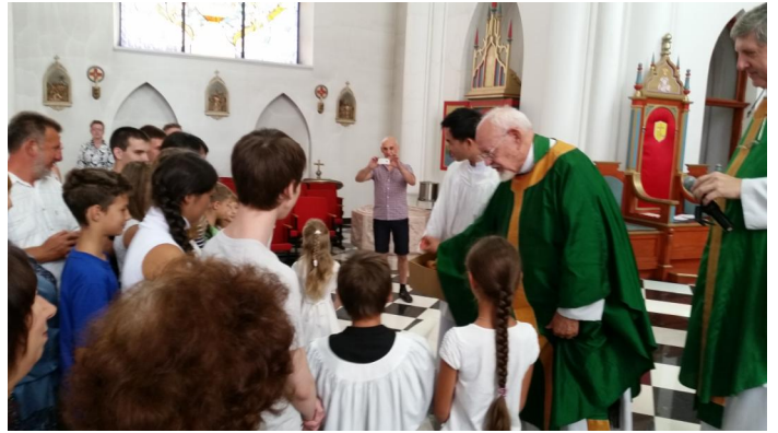
Just see if you can manage to save an apple for the teacher!

● Every Fall on the Sunday before school starts there is the blessing of pupils and teachers in Vladivostok, and it wouldn't be complete without everyone getting an apple!