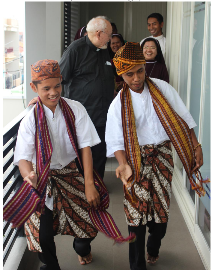
The seminarians in Surabaya, Indonesia gave me a rousing welcome in native costumes!