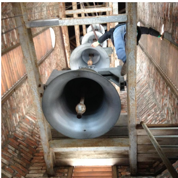
The bells as they hang now.

● Thank you to a benefactor family who bought a new sewing machine for the kids at the orphanage in Novoshaktinsk. The orphanages are busy teaching the children life skills, something that wasn't done in earlier times. Sewing and cooking are included in the classes, and the orphanage even made a "home size" kitchen in which the boys and girls can practice. This machine is in the sewing room where the kids make clothing, ornaments, holiday costumes, and sometimes just plain old fashioned repairs.