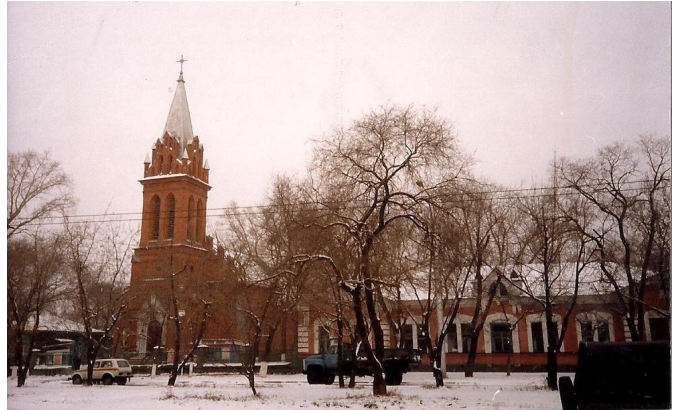
The old Transfiguration Catholic Church and Catholic hospital in Blagoveschensk.