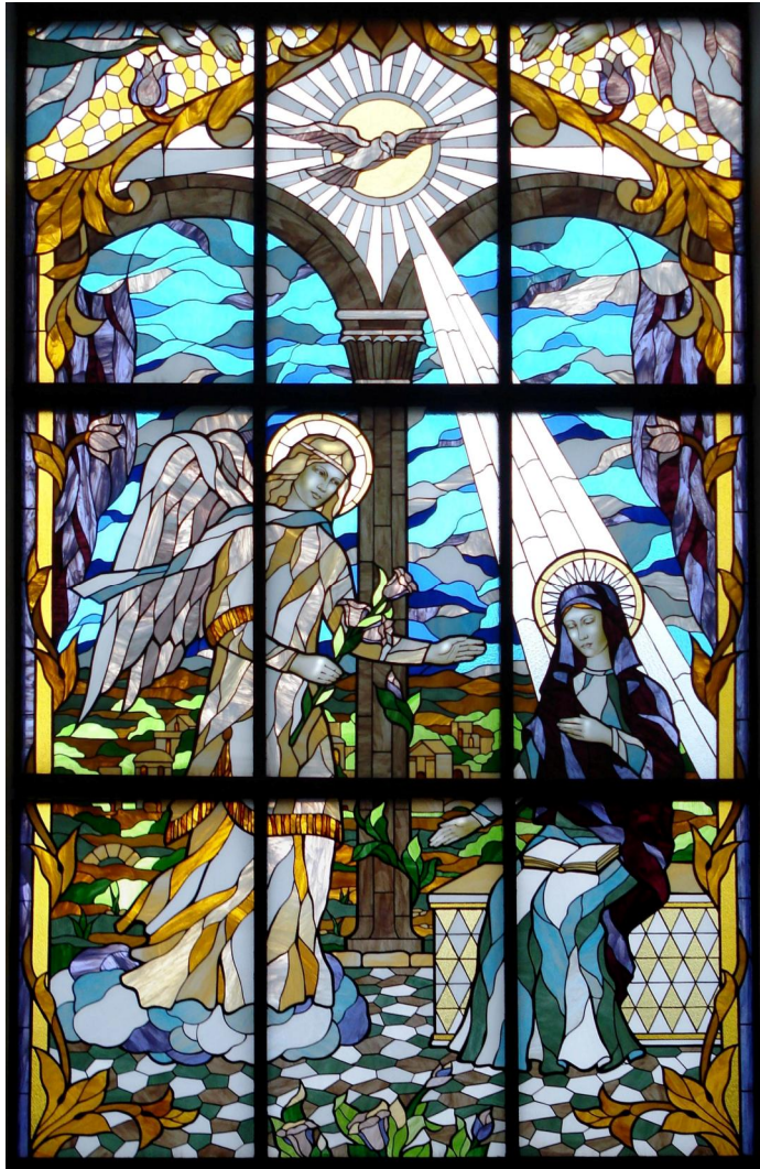
The Annunciation window in Vladivostok