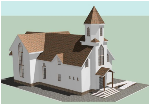
Proposed church design for Our Lady of the Pacific Parish, Nakhodka