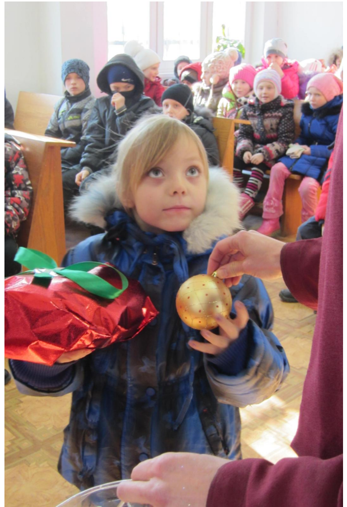
A Christmas present, just because God loves the children.