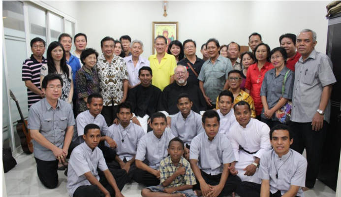
Benefactors with some of our Indonesian seminarians in the Our Lady of Vladivostok Chapel

able to speak and show a video of our plans. It is a great blessing to already have benefactors in Indonesia to help with the foundation of our Indonesian C.J.D. communities.