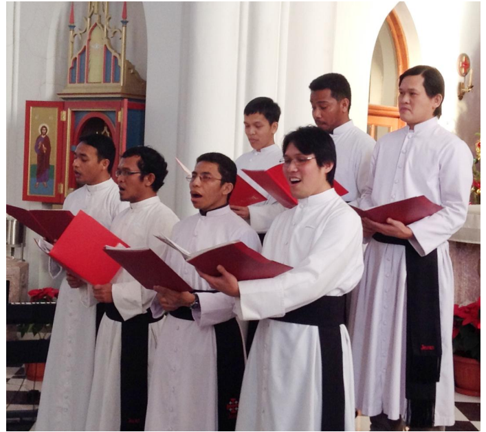
The seminarians also sang in the Festival.

• Our most recent big event was the 16 th annual Festival of Christian Choirs , which was a huge success, and I'm happy to say that all the choirs were better than they were last year. The Methodist choir was quoted as saying, "We wouldn't miss this for the world! We practiced twice a week for three months!" Here is a photo of the joint choir which ends the Festival when all the choirs sing together: