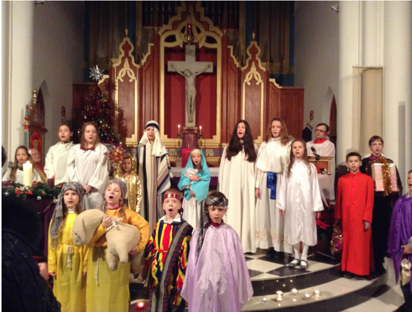
Vladivostok kids present their Christmas program.

Mary Mother of God Mission Society: Reviving the Roman Catholic Church in Eastern Russia Issue Number One Hundred Sixteen March 1, 2014