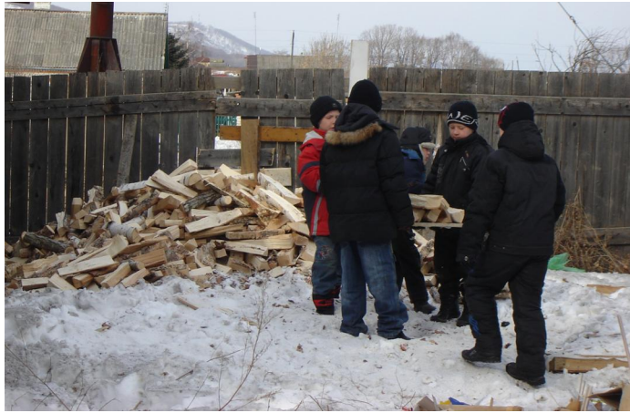
Tropinka boys learning how to chop firewood.

For the blessing and grand opening all the walls of the corridors and main activities rooms were completely covered with myriad large, colorful, action-packed photographs of many of the children the center serves and of the volunteers who generously give their time to lead the various classes and activities that the center offers. The effect of these photos was to create a bright atmosphere of the care and commitment these children receive and of their great worth as human beings and members of society.