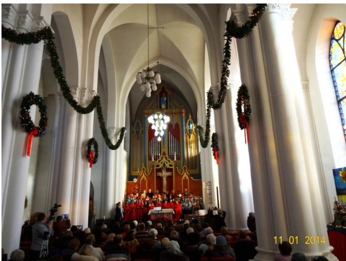
The joint choir at the end of the Festival