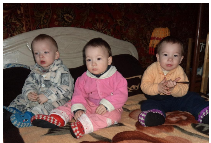
Triplets need three more guardian angels!