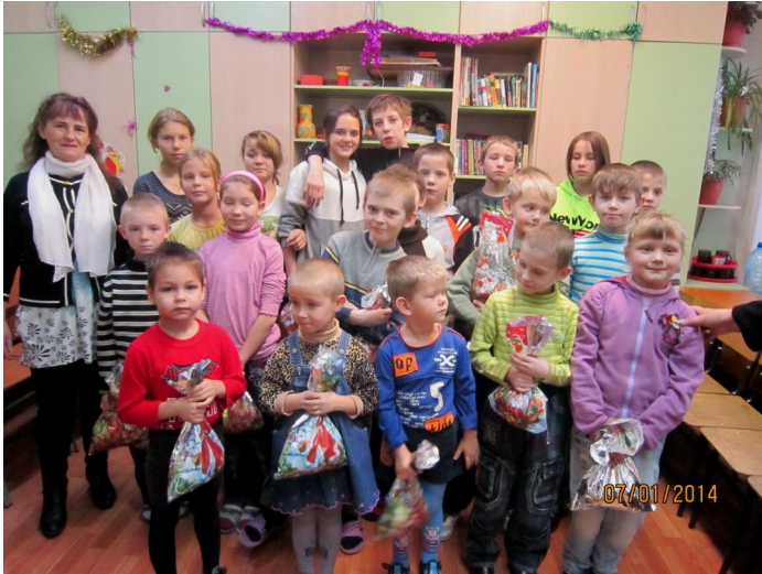
Somebody cared and remembered us at Christmas!

come to take them home for the Christmas-New Year's holiday. Our presence brought them happiness with our Christmas gifts. While talking with the children, I could feel in them the sense of coldness to life and to the world. Most of the children have parents who are either alcoholics or drug addicts. So the children are not allowed to meet their parents, or go home. We hope our presence brought them happiness and hope. God bless these little children!" Thanks, benefactors, for providing the gifts for these social orphans!