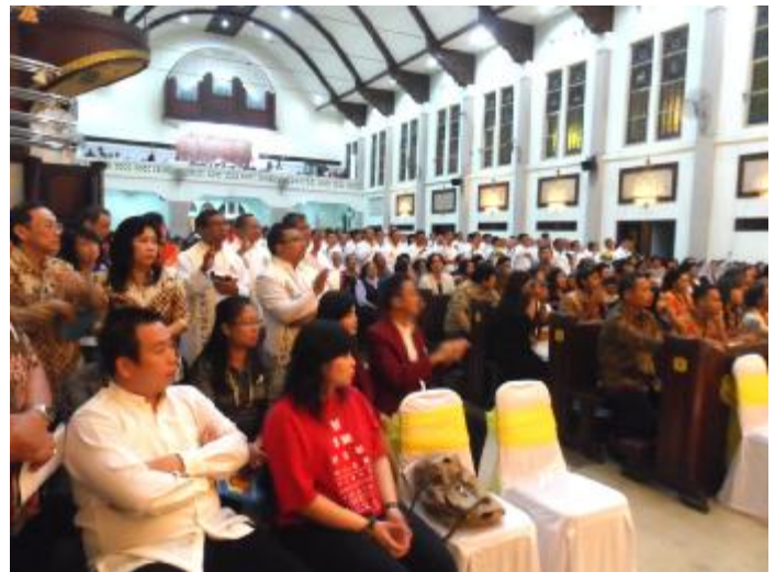
During the ordination of so many priests the Surabaya Cathedral of the Nativity of Mary was packed.

been arranged and loud speakers set up under canvas roofs erected for the occasion. Police were on hand to help with