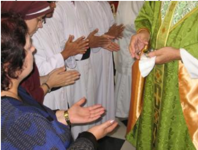
Medpersonnel have their hands anointed after prayer.