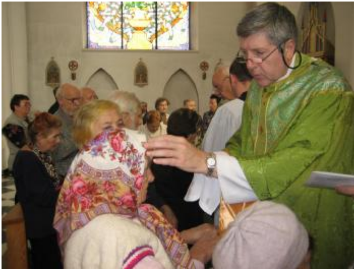
In very bad weather the elderly can't come to church.