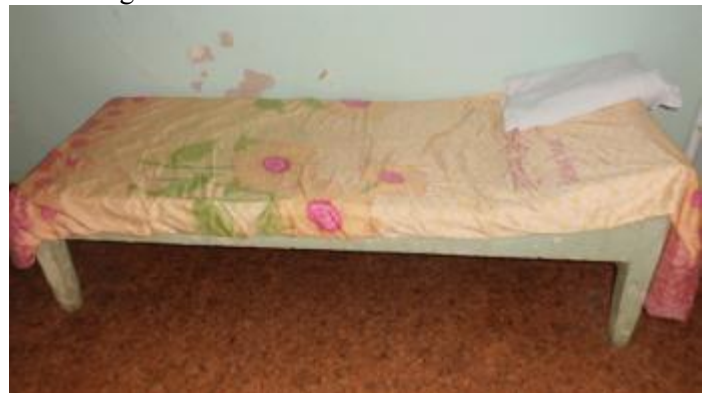
A current hospice bed