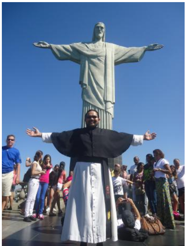
Myself at Cristo Redentor

Remember “Mary Mother of God Mission Society” in your will.