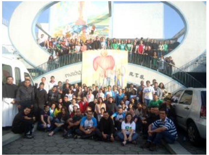
Group picture before the parish where we stayed in Rio