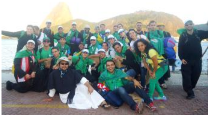
After our lunch in the street during our 9km walk for the vigil with the Pope, at night we slept at the copacabana beach in our tents and sleeping bags.

The overall experience was amazingly wonderful, and indeed very powerful, the witnessing factor of the people gathered together, singing while walking kilometers to and fro, praying together, sharing life and experiences together was so great that it enriches each one of us present to keep the light of faith burning ‘til the end. The WYD was a simple yet powerful tool to show us that our Church is so alive and still young. It was so great to see young people so much dedicated to their faith, so much in love with Jesus our Lord, and so active in the service of others in Jesus name.