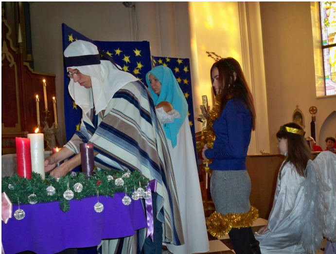
Joseph and Mary bringing the child Jesus while the angels watch—in our Christmas pageant at “Midnight” Mass.

didn't know what to do, I was left only with 10 pesos, that is less than a quarter dollar, I used that 10 pesos to come home here, and just 5 minutes ago, I called a TV report channel, asking for help, they already called the police for me, I also called the bank, to freeze my account. My wallet was stolen, with money on it about $200 and my ATM card was with it. Imagine, I was dressed in my religious habit, and still the thief had no shame to take my wallet. I do not know what to tell you. Now I am waiting for the police to call me to report the incident.”