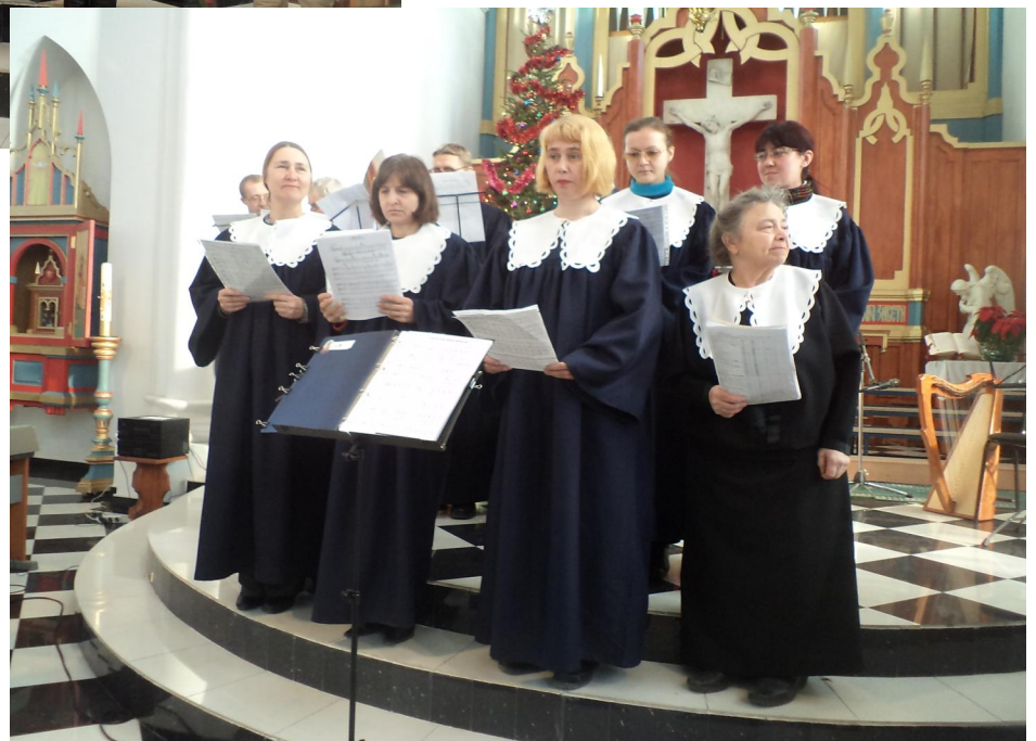
The choir from St Paul's Lutheran Church always performs with Germanic control and accuracy. The Church was PACKED.