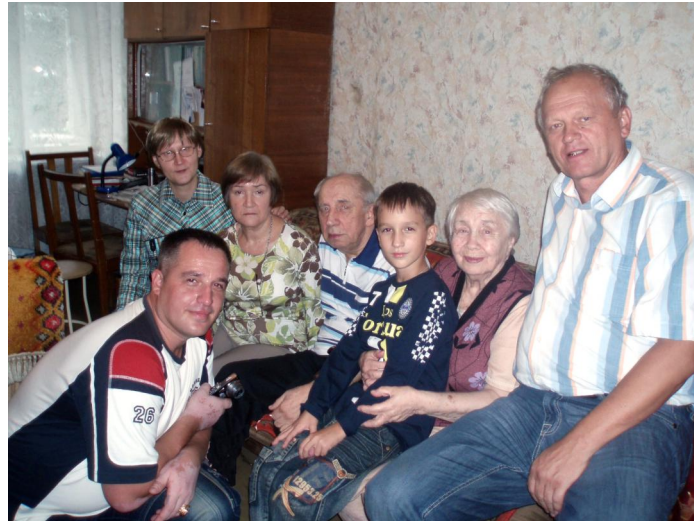
Son, grandchildren, greatgrandchildren at his birthday party.

Economics of Energy. Now he is Honorary Professor of Education, with the appropriate medals. As a reader in the organization “Knowledge” he has presented many, many lectures throughout the Far East. “Study everything always,” could be his life’s motto. When he was 70 he began studying English, and at 73 he studied computers. He is still sharing his knowledge and experience with the young generation. We hope he can do it for years to come.