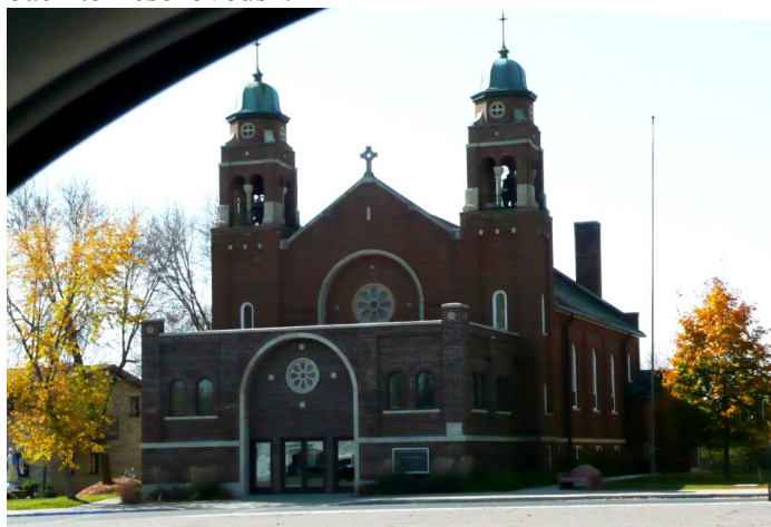
St John the Baptist Church is well cared for in the center of Edgar.