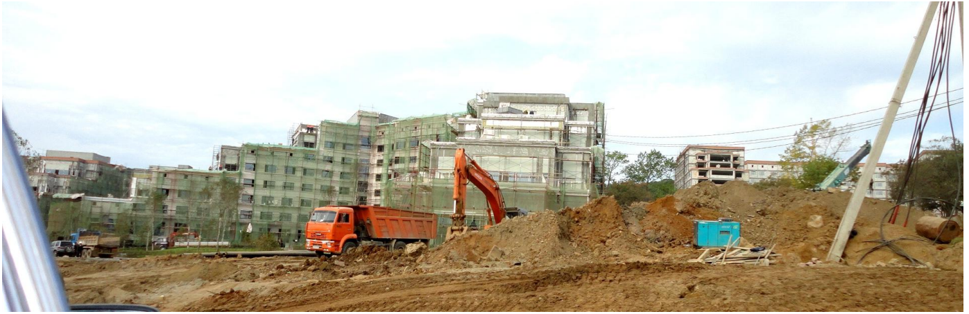
Central Administration Building

The gigantic size of the buildings shows by comparison with the four huge cranes used for construction.