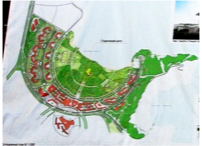
A map showing the new campus of Far Eastern Federal University. The red zones are new buildings.

We've mentioned Russian Island many times in these pages, as we have had many retreats there, and AA uses it for their rehabilitation programs. Now the new Far Eastern Federal University will be there, about a mile from our facilities. Naturally we are hoping to open a Women's Support Center near the university, and provide spiritual and evangelization programs for students. Chances are good that there will be many Catholic students at the university, as it is expected to draw students from all over the Pacific, including the more Catholic countries of the Philippines, of South Korea, and even South America. We have to get ready.