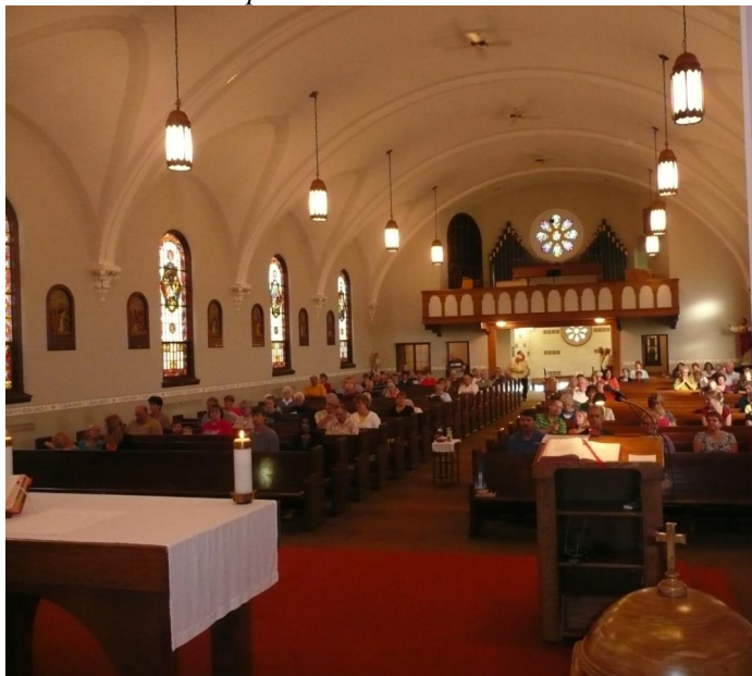
The St John the Baptist Church interior