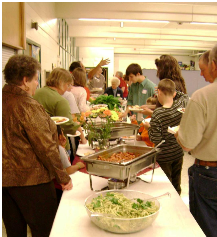
Food line at St Joseph's School

basketball game tonight because of so many cars in the parking lot. In excess of one hundred friends, family, and supporters had gathered in the cafeteria to greet Father, singing, "Happy Birthday", to him. People from Arizona, Arkansas, California, Illinois, Kentucky, Minnesota, and Missouri were in attendance.