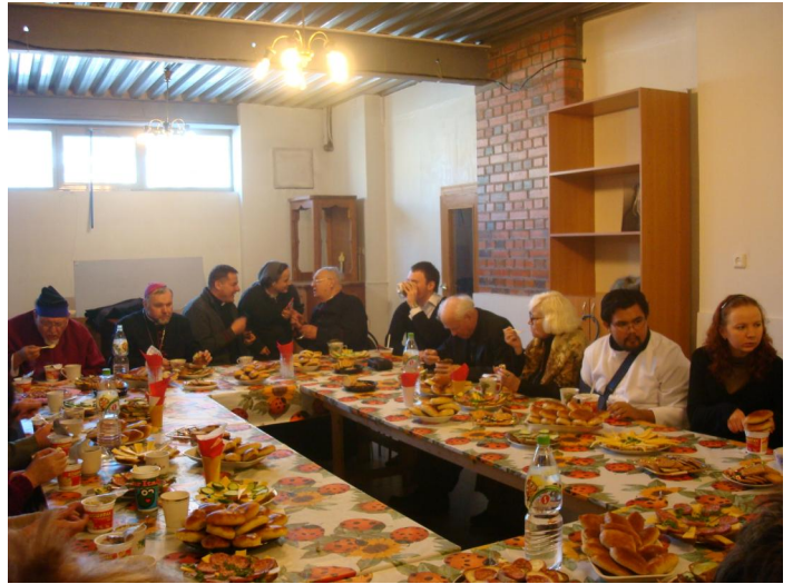
The day concluded with lunch for all who attended.