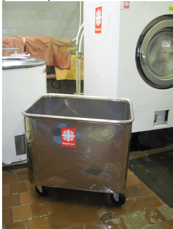
The “free” laundry cart.