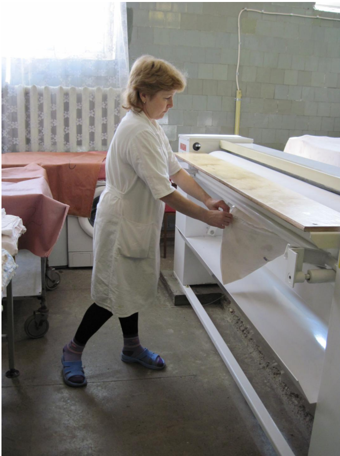
The ironer will be great for sterilizing bedding for the orphans, including the HIV positive kids.