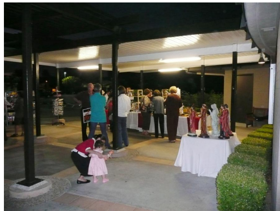
Volunteers selling religious good after Saturday night mass in Modesto.

♥ Office Needs. In order to assist our priests in Vladivostok, countless details are tended to daily in the Modesto, CA office. Scheduling parish visits, maintaining our database, making mission travel arrangements, and sending and receiving emails to and from volunteers and supporters throughout the world are just the beginning. Can you imagine coordinating all the US mission operations with only two computers? Yes, that's right! We must limit how many can help at any given time as we must take turns using the computers when more than two people are working. You can guess how much more efficient we could be and how much more we could accomplish for our priests, if we had the proper tools. We pray you can help us. We are badly in need of two additional new computers, a paper shredder and a paper folder. Please contact the mission office at 209-408-0728.