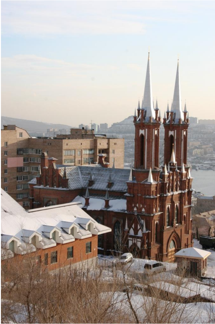
Photo of the church and steeples taken from Beauty Street. You can see that the steeplets above the transept are still not done.