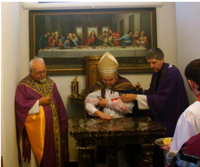
The blessing of the altar in the chapel. The Relics of St Theresa the Little Flower were enclosed inside.