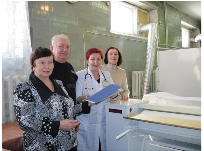
Caritas crew that oversaw the installation with the Head Doctor of the Hospital #3.