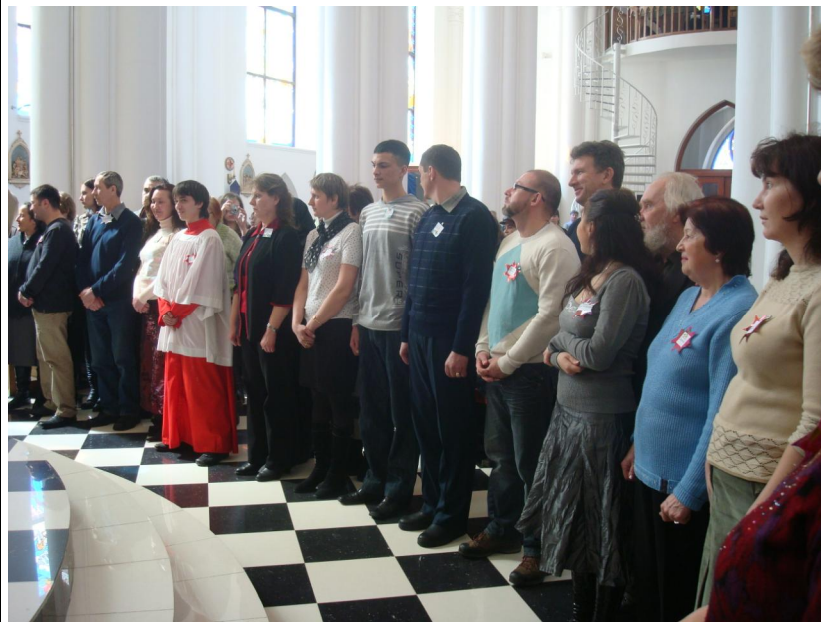
Those to be confirmed standing before the bishop.

here nearly 20 years, there are still people who don't know that there is a Catholic parish here. Now the steeples are visible, at least in daylight, and we want to illuminate them at night, when and if we can afford it.