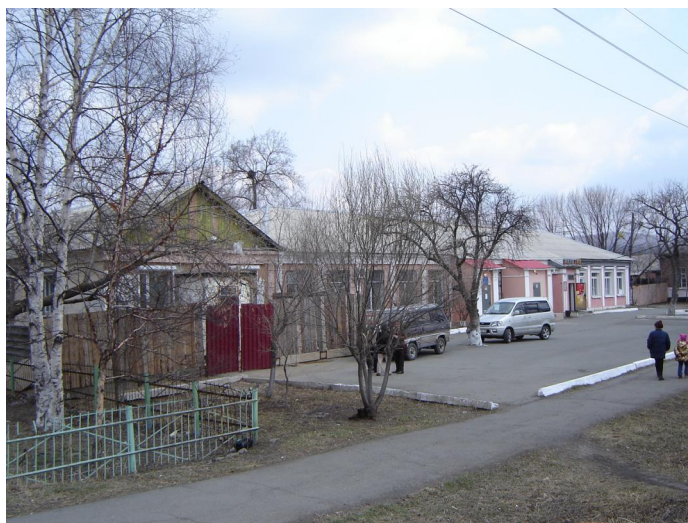
The center, on the left, can be seen as one of the four premises of the "Romanovka Mall".