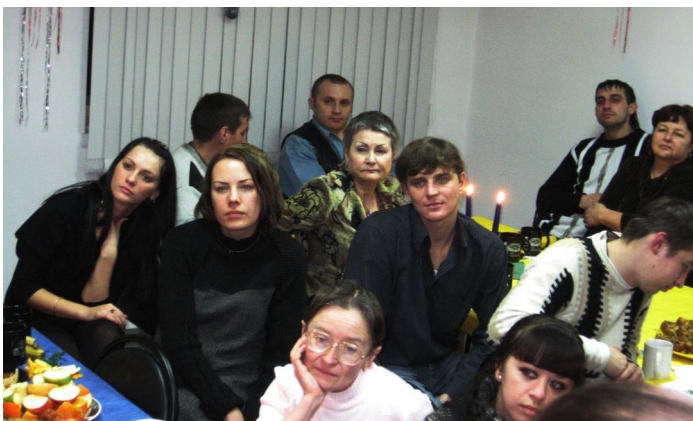
Alpha "students" learn about Christ.

The Omega Student Program has more than 50 people involved in the various programs so far, and 50 more involved in their internet club. All of the programs have been running this year, including Alpha Course (they are on their third course already), Omega Literary Club, Vladivostok film club, Inquiry class, Language classes. We are planning an exhibit in May of student art and music, which should bring new people into the program, as we will pass out their literature and brochures there. We are also planning some special seats for students at our Easter organ concerts, with perhaps "meet the musicians" afterwards. We are planning a day's retreat in May at a camp outside of town. And it should also be noted that the Parish of Our Lady of the Pacific in Nakhodka has already began working on Omega programs, seeing our successes here in Vladivostok. Probably in the near future we will also begin working at St Joseph's parish in Second River for those students who both live and study in that distant district of the city