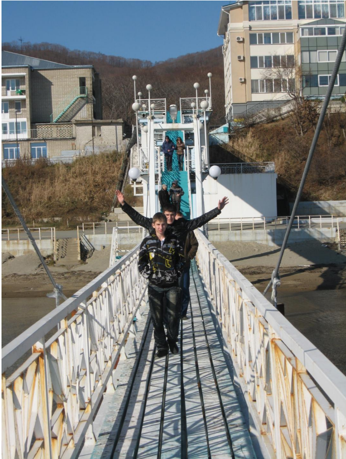
The walkbridge for students over the construction site of the new "Golden Gate" bridge in downtown Vladivostok.

Far East. Besides keeping and extending all current programs of the both indirect and direct evangelization such as a movie-club, culture and literature club, and Bible studies, we plan on organizing an annual Christian-values oriented photo contest for students. We also plan to perform a pro-life play which would involve local drama students. Because of the youth's desire for an active lifestyle we are going to start some sporting events and hiking pilgrimages.