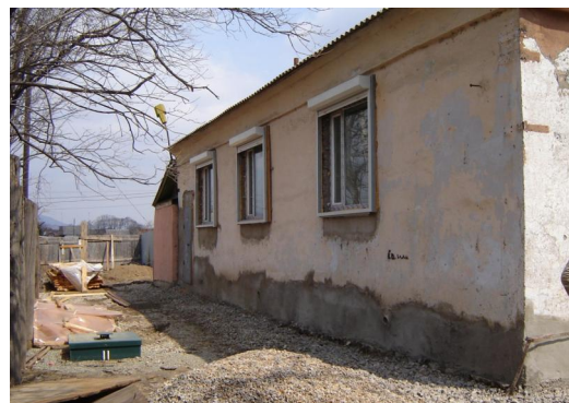
The side yard and back yard in the background.

The exact date of the blessing and grand opening of the center is not yet known. The sisters hope that it will be ready by the new school year, but that depends in part on the availability of the remaining necessary $20,000.