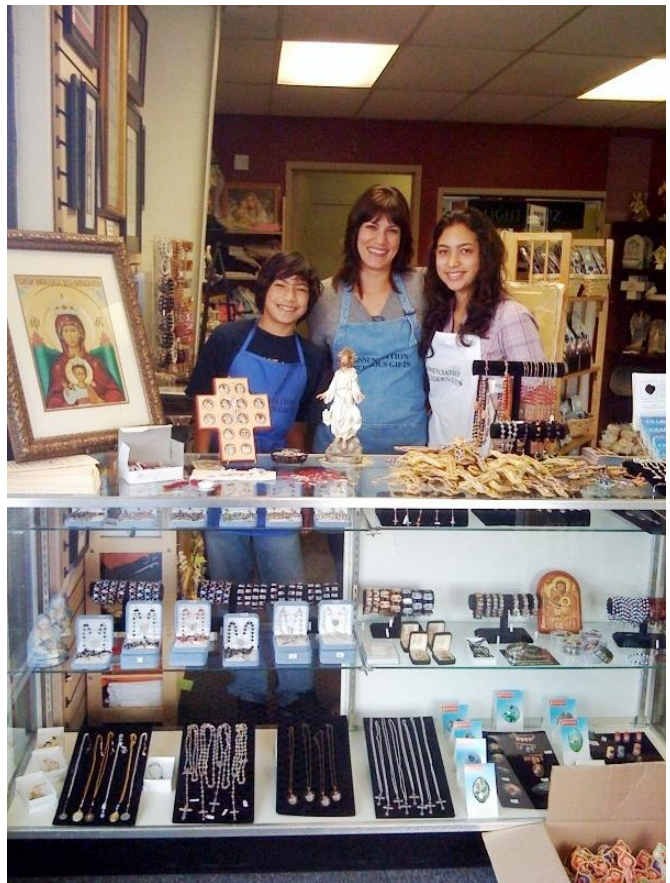
Smiling faces will surely attract customers!

Proceeds from Annunciation Religious Gifts go back to the mission whether in more merchandise or to the mission in Vladivostok. (See Development Desk on pg 8.) Not only do we carry Russian icons, baptismal gowns and gifts from Russia, we have Mystic Monk Coffee, Fair Trade tea and gifts, books, CDs, DVDs, statues. We have hand crafted items from monasteries and convents throughout the US to help the religious communities while helping our mission.