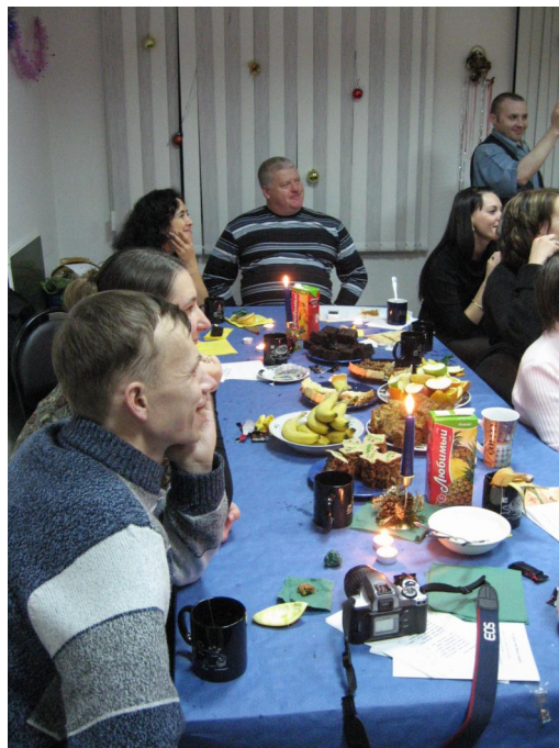
The Alpha Course includes supper.

About Alpha. Alpha is a course of 12 lessons. It is a practical introduction to Christianity which is offered by our Center as a direct evangelization program. Last year's experience proves that many students are interested in continuing their encounter with Christianity by participating in the Alpha Course. During this course students and their friends receive more profound knowledge regarding matters of faith, get answers to their questions given by young Catholics, get to know new friends among Christian youth, and participate in prayer meetings. A lot of people, who have graduated from this course want their friends to go through it as well. They offer help to organize the next courses. We hope that the natural result of our work will be their participation in the baptism preparation and active participation in parish life.