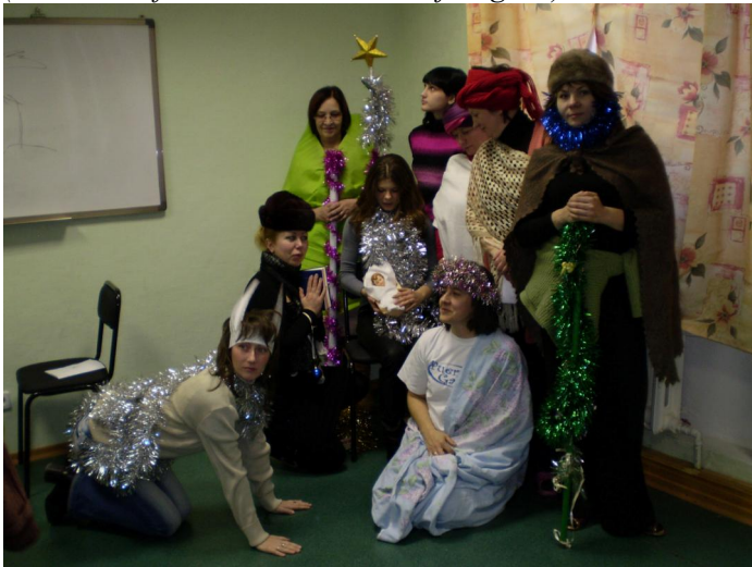
The Christmas "Play-Prayer"

(Continued from second column of Page 1.)