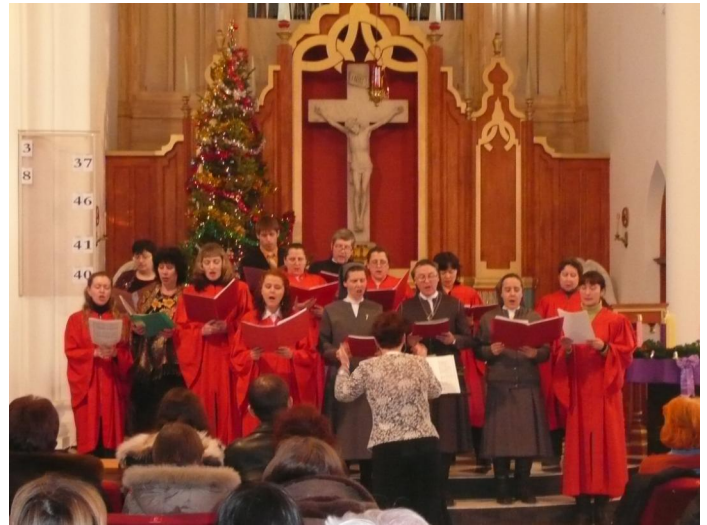
Our parish Liturgical Choir performing at the Christmas Festival of Christian Choirs