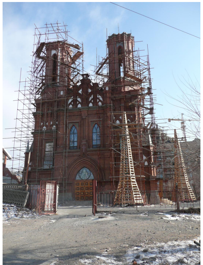
Metal Cladding and crosses, and the spires will be ready to raise to the top of the steeples.

Here is today's photo. The steeples have their masonry done. The "skeletons" for the two spires are standing ready to be metal-clad. The crosses for the tops are already being done in Vladivostok. When all the parts are ready, we have to hire a tall, tall crane to lift them all into place, and then there is the process of fastening them to the towers. After that, we plan to do lighting from the ground so that they will be visible at night (for evangelization). The bells blessed by Pope John Paul II are already in place. Now the carpenters are working on the wooden slats for the bell openings.