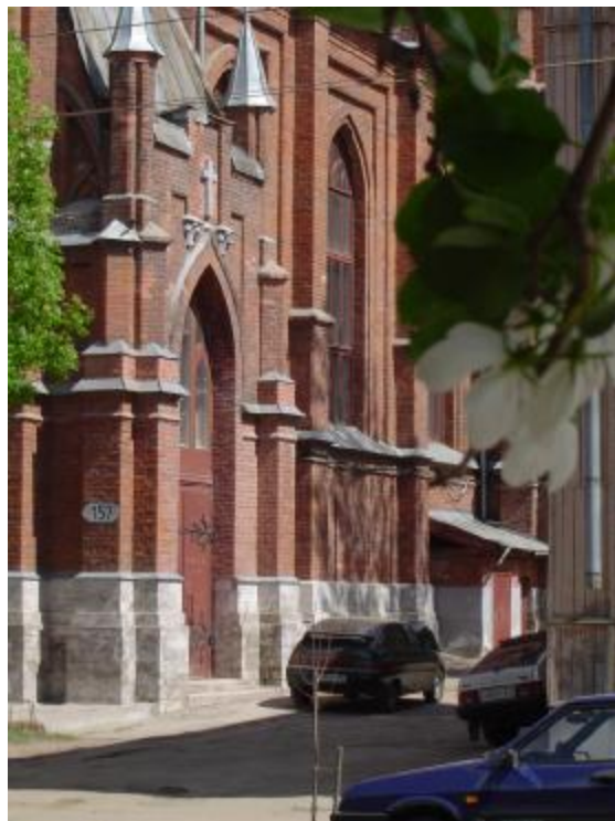
The side entrance to the church in Samara.