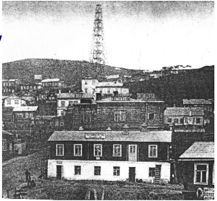
Photo of the proposed area for building the masonry church, sometime before 1908 when the first radio tower of Vladivostok was located on the land. The white building just below the radio tower became the chancery of the Diocese of Vladivostok.