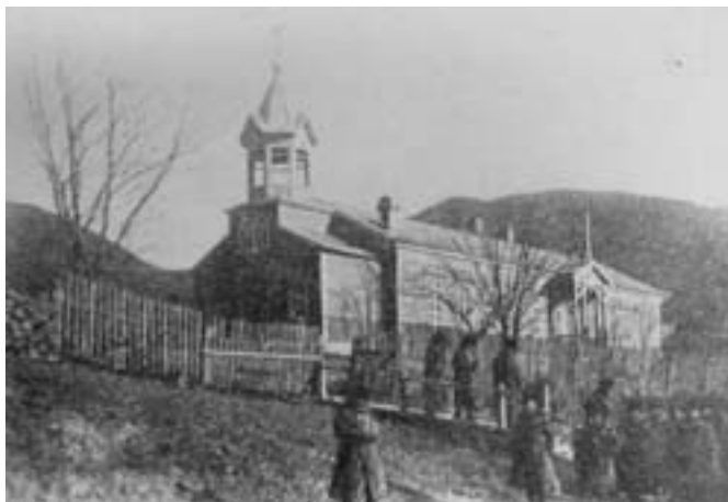
The first parish church in Vladivostok

Four years later the City Council dedicated a piece of land in the center of the city for the building. They built a small wooden church on it which served the parish for eight years. It was called the church of the Birthday of Most Holy Virgin Mary. On the night of February 2, 1902, it burned to the ground. The parish quickly built a temporary prayer house of the barracks type which they called the Most Chaste Virgin Mary. They hoped to build a larger brick church in short order, but various factors delayed the completion of the building for 19 years!