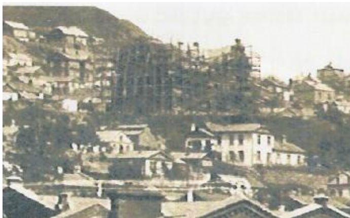
The building surrounded by scaffolds, probably 1920.

In those days the temporary wooden building would hold only 200 people, but there were about 5000 parishioners! Most of them were lesser officers of the various military formations including the naval fleet, and their families. The new pastor was quick to search for possibilities to continue the church construction. He also paid a lot of attention to the parish charitable organization, “Dobrochinost,” developing care for the poorer parishioners and the children.