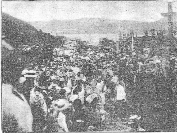
Laying of the cornerstone by Bishop Cepliak, 1908. His mitre is visible in the bottom, center of the photo.

Russia, which included the territories of Primorye, Khabarovski, Amurski, and Sakhalin Island.