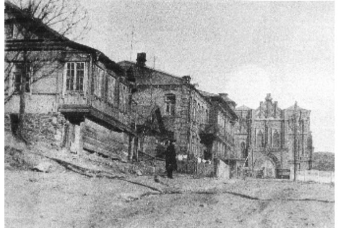
The church with the two school buildings, after the reconstruction as an archive. 1950?

The wonderful Catholic church building was given to the State Archive. The walls were pierced by steel beams which divided the nave into four floors, and they began to store documents there.