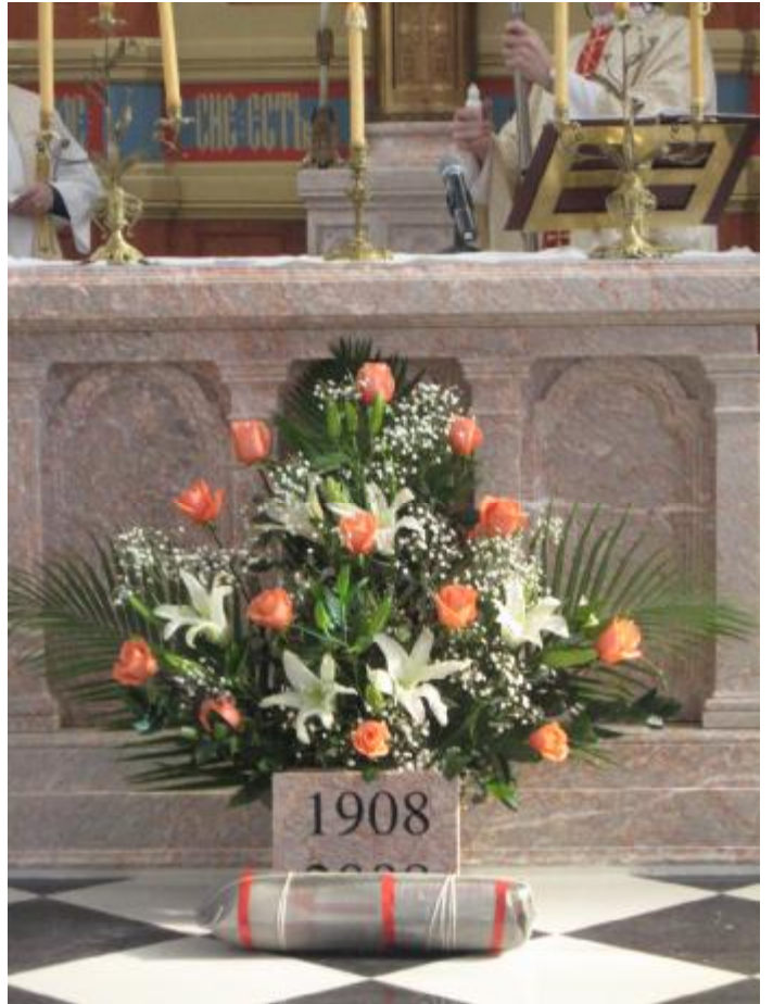
The time capsule that was buried under the new cornerstone.

Meanwhile, we are working on the steeples! We weren’t done by February 3, of course. We’re only halfway on the financing, but we are relying on God (and benefactors) to provide. We have about 70% of the needed amount of $120,000.