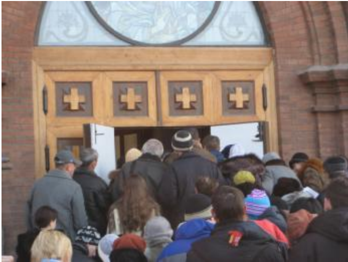
The crowd entering the church as the doors were first opened.