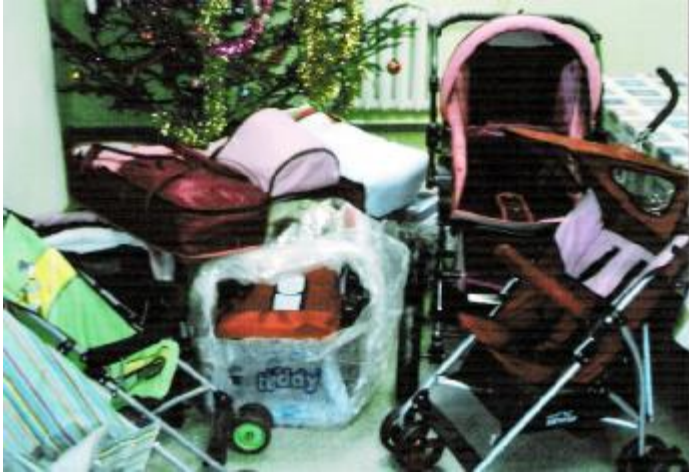
Was it Santa who left these things below the Christmas tree?

received requests to help with strollers, blankets, and other equipment. We were able to give money from the Modesto funds to provide those needs. Thanks, Modesto! The durable items are loaned to moms for the length of the need, and then returned to be loaned to others. We received lots of thanks for this project, and lots of photos. Want to see some?