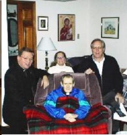
Father McGuire's Mission Share Inc., Kentucky