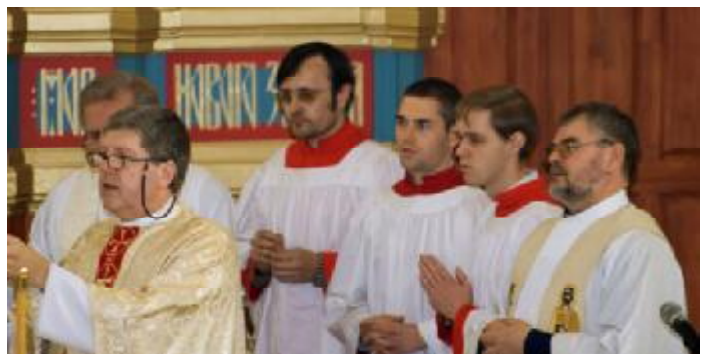
The servers aren’t used to this level of solemnity.