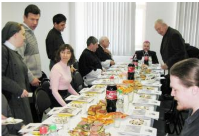
Post-blessing dinner: The Bishop and Parish Council.