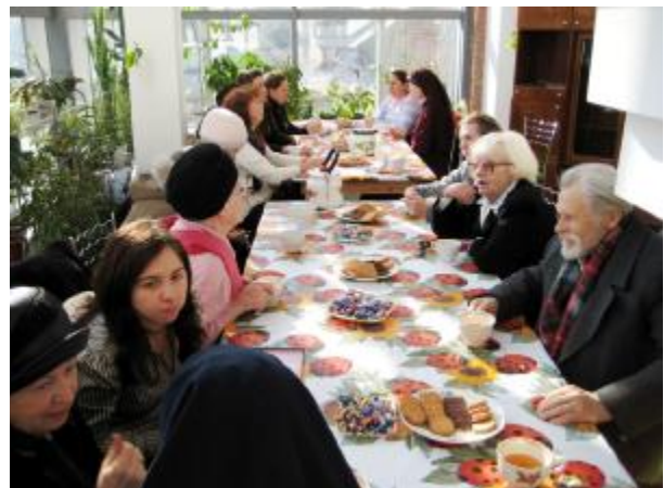
Rectory first floor, tea after Mass in the "Winter Garden".