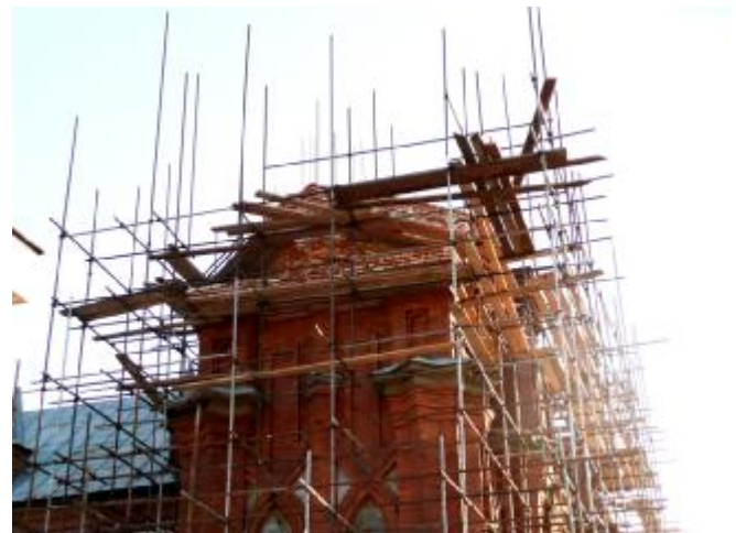
The steeples are already straining upward..