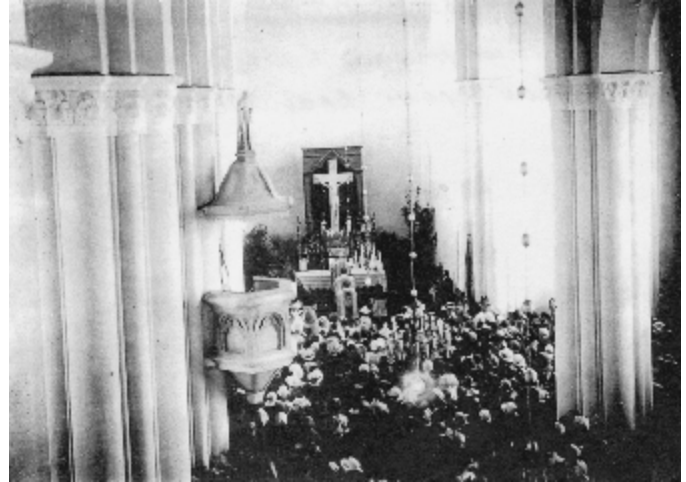
The first consecration on October 2, 1921.

the local newspaper “Word,” and consider the fact that it took 31 years to see its grandeur.