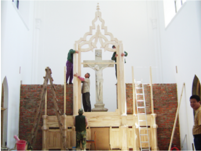
The raredos begins to rise.

Here are the latest photos as the carpenters begin to install the lower raredos into place.