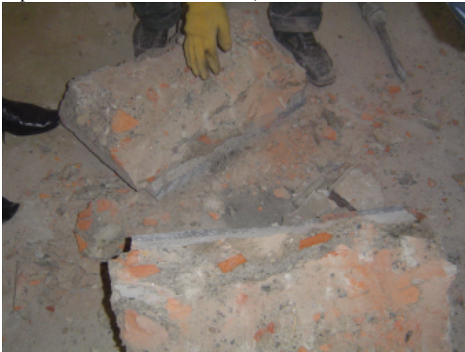
The split cornerstone with nothing inside.

Working on our church building is partly like doing archeology. Several years ago, when a workman was putting down new baseboards in the vestibule he heard suspicious hollow sounds in the floor. We removed the tiles and the underfloor to discover a big cornerstone with the date "1908" written on it. Naturally we cleaned it up and showed it to visitors, but we never knew if it might be hollow and contain a "time capsule". June 12 we had to take up the whole floor in the vestibule to prepare for the new one, so it was the perfect opportunity to find out if the old cornerstone had any surprises for us waiting inside. First, with witnesses present, we dug under the stone, only to find just rubble there. Then we split the cornerstone down the middle, and we found nothing, not even an air space. So that is the end of that. We are determined to place a new cornerstone on October 7, with a time capsule. It will be dated "1908, 2007."