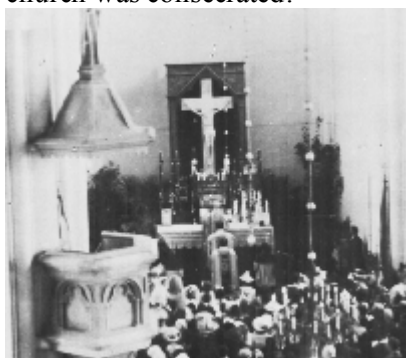
The Crucifix in 1922.

May 14 was an historic day for us! As part of the church restoration we placed the heavy marble crucifix back in the same spot it had occupied in 1922 when the church was consecrated!