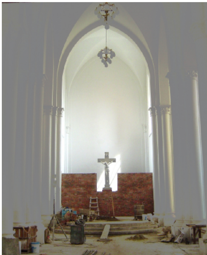
The Crucifix in place, May 14, 2007.

The plan for the tabernacle screen around the Crucifix.