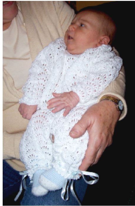
This is a 1-piece jumpsuit with pearl opening for boys, size 0-3 months.

See our gifts from Russia on our web site for more samples. Soon many different styles and stitch patterns will be available on e-bay under “baptismal gowns”. Watch the site for new items. What you see on our site or on e-bay is what we have in stock.