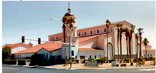
St Joseph Husband of Mary Parish.

Hotel: (702)256-3766 Las Vegas, NV 89117