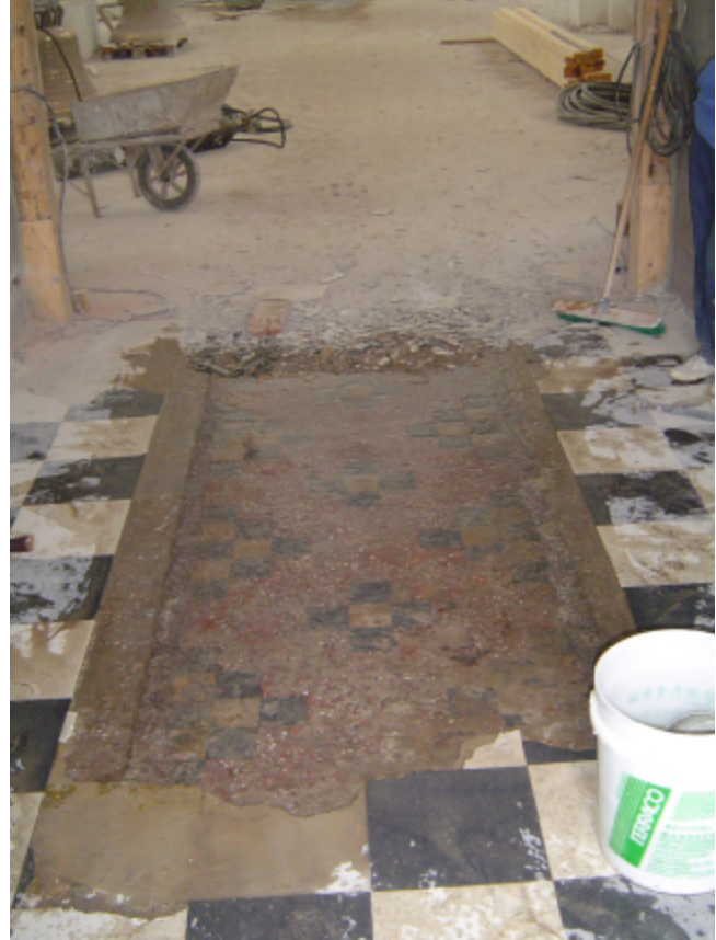
The old terrazzo we found in the vestibule.

In the middle of the floor of the vestibule we found some old terrazzo with some crosses, which might explain the old rumors that there were mosaics in the church. The terrazzo was in too poor condition to save, no matter how we thought we might try, but here is a photo at least.