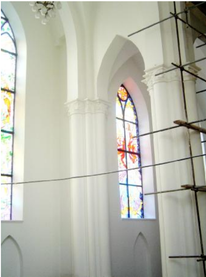
The clean white walls will allow the stained glass windows to shine! Scaffold still standing on March 19.