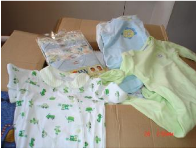
American visitors bring children's clothing for the Centers.

directors of the Centers and all the Centers' directors and volunteers, we can continue to provide a necessary service, a beautiful and important service to our society in which the scourge of elective abortion continues to grow at an alarming rate.