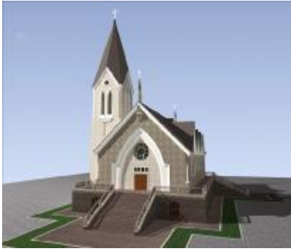
Architect's proposal for the new Our Lady of the Pacific Church in Nakhodka. It will be two blocks from the bay.