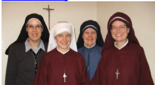
The Sisters are planning to come to the Reconsecration.