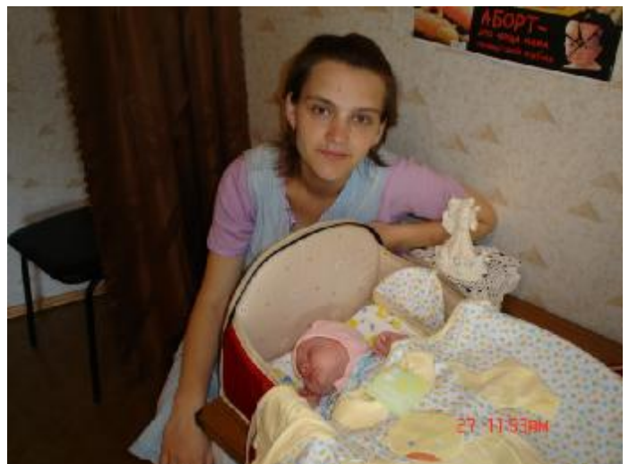
Young women come to the Centers for help.

It is not always easy to follow through on projects in Russia! Legal and even mental constructs of charitable