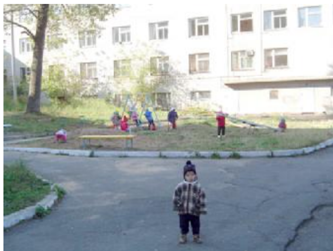
Playground equipment at Children's Hospital #3.

We began pricing and figuring out how to carry out this work when our worker heard that a Russian businessman had donated a set of playground equipment to the city in the general area of the hospital. So our representative went to him, and he agreed to donate equipment to the hospital, too! So it turns out that due to the grant from the Social Outreach Committee we were able to get playground equipment free of charge! See the photo.