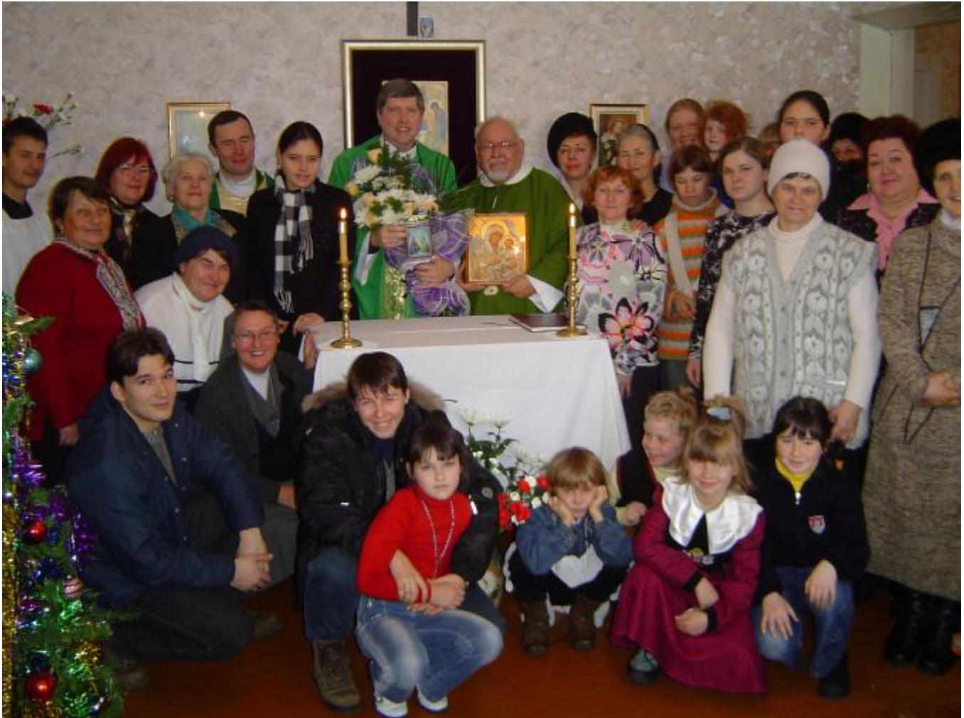
Romanovka parishioners gathered in their very small chapel for the event of change of pastors on January 14, 2006.