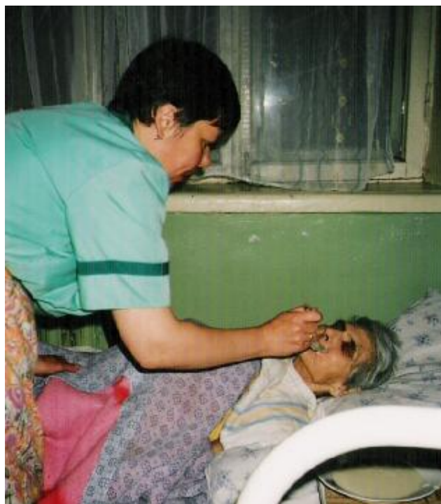
Feeding the dying at the hospice.

mission - because of our Loving Father in Heaven - there was someone who would share God's love through a smile with strangers on the street. Because of our humble mission, communities gather again in the house of God, joyful and smiling in the richness of His peace, love and friendship.