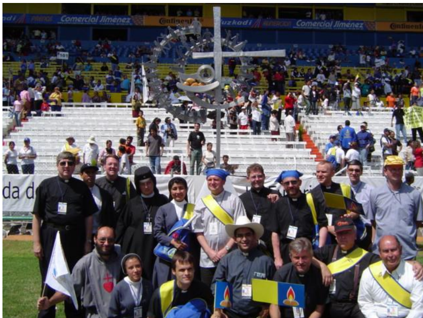
The Russian Delegation