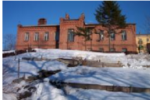
"Salvation Coast," the new AA rehab center on Russian Island.