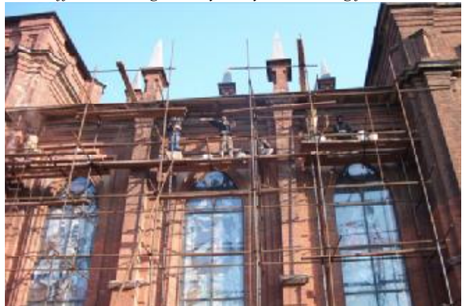
The scaffold standing already two years waiting for workers.