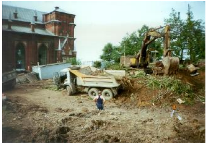
The construction site for the Our Lady of Fatima Rectory and Parish Center.

Ages ago in these pages I spoke about the need for capital for the church in Russia. Our neighbors to the far north in Magadan just “completed” their church, but are still suffering from lack of funding and most of the office space is not completed. Romanovka is hoping to solve its need for a church, working with its sister parish in Oregon. Nakhodka now barely has a chapel to call home after ten years, but still not a church. No parish in Nakhodka’s sister-city of Oakland, California even answers our mail. Arsenyev has bought an inexpensive old wooden log cabin to call a church after eight years of its existence. The Blagoveschensk parish is still in its “temporary” chemical laboratory even though the Russian Orthodox Church has already completed its new cathedral there (with major help from Catholics) and none-the-less refuses to give the Catholics back their historical building for a decent church—the one that their ancestors built from private funds! In Khabarovsk the old wooden Catholic church has been condemned by the fire department, but the government refuses to give it back to the Catholics so that they can build their new church on the land. (Earlier they offered me a piece of land to build a church on for $1,000,000!) In Ussuryusk the parish bought a small three room wooden building with help from South Korea. And in Vladivostok? We too are still waiting, hoping and praying that this will be the summer!