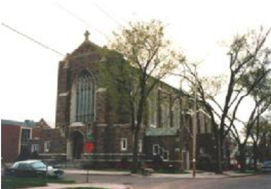
Nativity's huge and beautiful church is one of its joys.