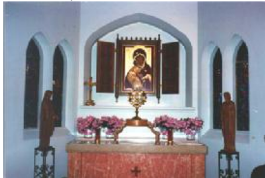
Perpetual adoration chapel at Nativity.

Wow! The process generally takes three days of work (9-4) to fold and tape plus 2 hours on the third evening to do the labeling and get the postal trays loaded for mailing and the bulk boxes ready for delivery to churches in Minnesota and around the country.