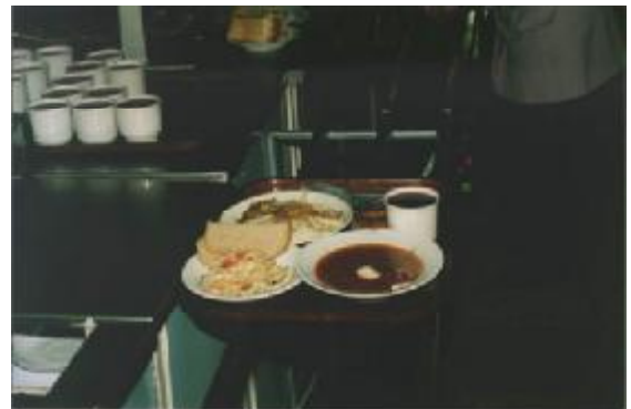
A nourishing dinner for those in need.

2. Feeding the street children. This program is coordinated by Rachael's Volunteers, a Protestant affiliated charity, but our parish takes charge on one day per week. We could use a food wagon which could make a profit from regular sales in order to pay for food for the children.