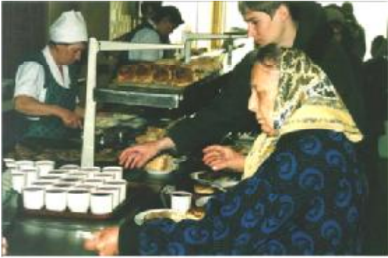
Our clients pay for their meal with a ticket from CARITAS

If the weather is cold, our clients can take a meal home so as not to have to be in the cold two days in a row.