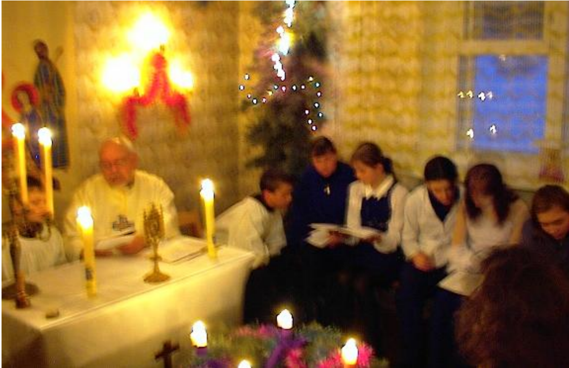
Christmas Mass by Candlelight at Nativity of Our Lord Parish, Ussurisk

Issue Number Thirty Seven January 1, 2001