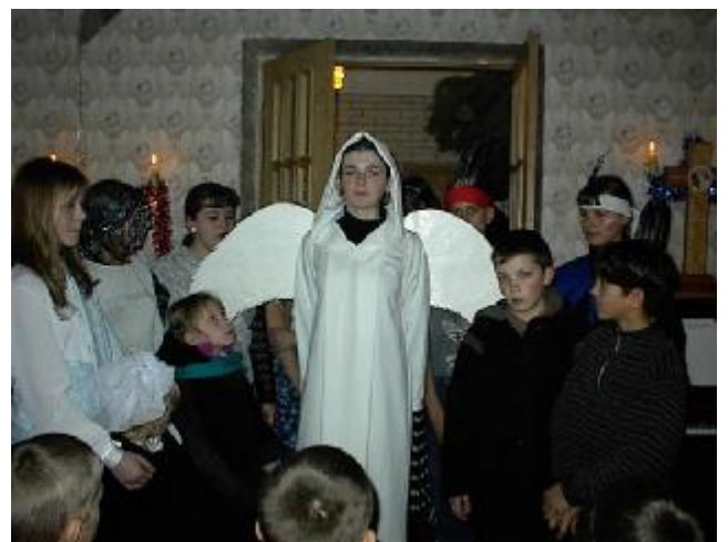
The Good Angel of Christmas and kids from the skit.