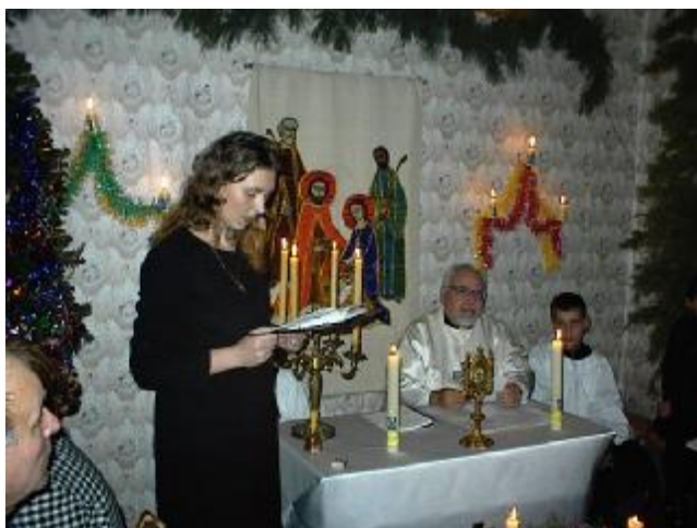
A beautiful Slabbinck Nativity banner graces the wall behind our temporary altar. We forgot who the American donor was!

a gift to us from the bakery where we usually buy bread for our charitable operations.