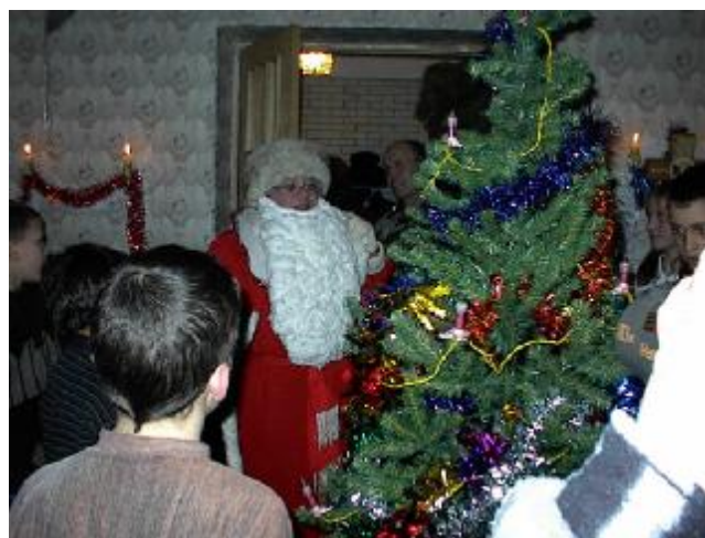
Grand"father" Frost was a hit. But where were the men?

Something is very obvious in Ussurisk--the parish apartment (three rooms) won't be big enough for long. When will we be able to build a church? And when will we have more priests? Something else is obvious—the parish will be a very active one, just like its namesake. Soon we want to start a Women's