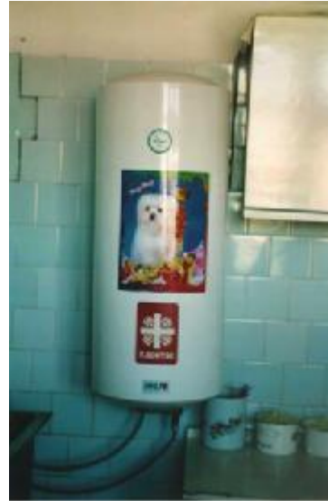
The hot water heater that CARITAS installed in the baby orphanage.