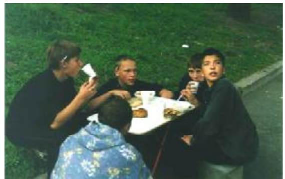
Boys from the street gather at one of the feeding stations. They won't cross gang lines, so several places are needed.